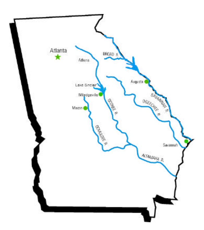
Figure 1. State of Georgia showing the location of GPC's Sinclair Hydroelectric Project and major rivers within the Georgia portion of the historic range for the robust redhorse.

During the early stages of FERC relicensing in 1991, a rare fish was "rediscovered" in the Oconee River downstream of the Sinclair Project. The fish was eventually identified as the robust redhorse Moxostoma robustum by several icthyologists.