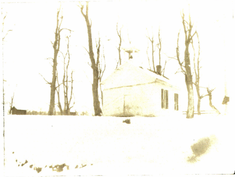
Locust grove, No. 146, 8-8. 1913.