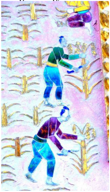
Photo 2. Harvesting millet, Tripitaka Library, Wat Xieng Kouang, Laos