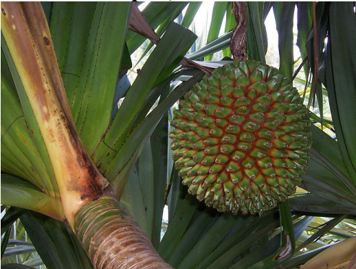
Photo 15. Screwpine, Pandanus utilis

Notes: The screwpine originated either in Madagascar or the Mascarenes, but has been carried around the world to tropical regions. It was probably brought to the Niger Delta by the Portuguese.