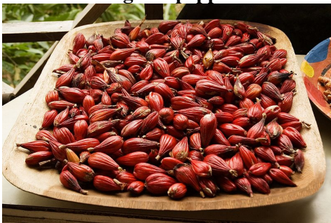
Photo 16. Alligator pepper