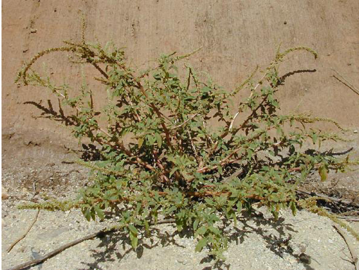
Photo 6. Spiny amaranth, Amaranthus spinosus