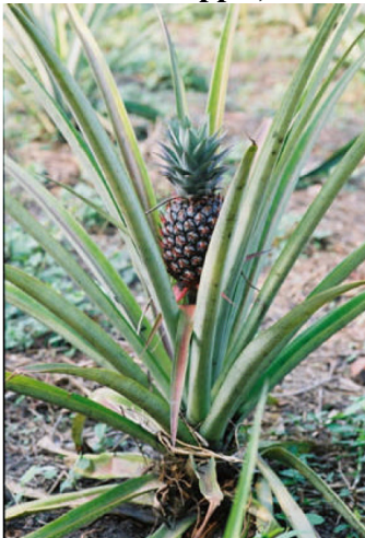
Photo 8. Pineapple, Ananas comosus