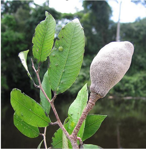
Photo 13. Guinea plum, Parinari excelsa