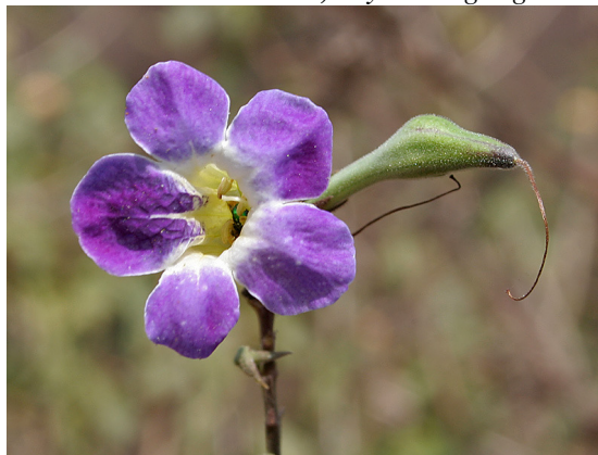
Photo 1. Chinese violet, Asystasia gangetica

ACANTHACEAE Asystasia gangetica (Linn.) T.Anders. 367, (410,423)