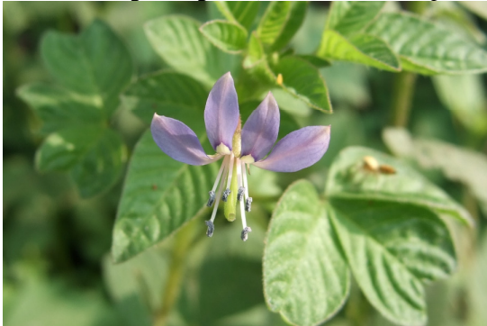
Photo 10. Spider plant, Cleome rutidosperma