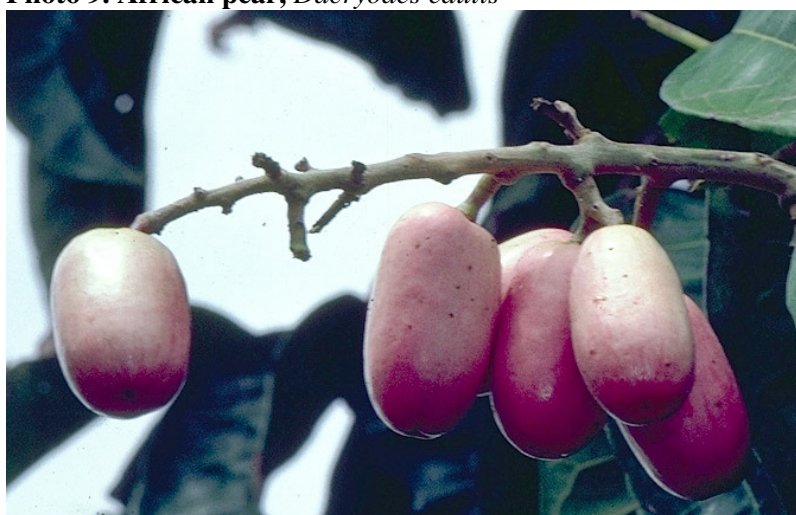
Photo 9. African pear, Dacryodes edulis