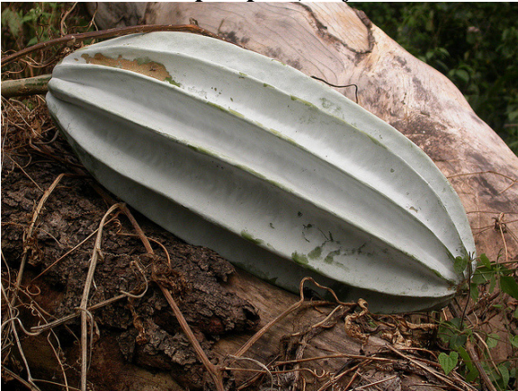
Photo 14. Fluted pumpkin, Telfairea occidentalis