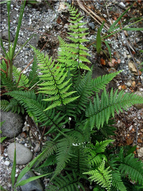
Photo 4. Silverback fern, Pityrogramma calomelanos

ADIANTACEAE Pityrogramma calomelanos (Linn.) Link 232; OP158