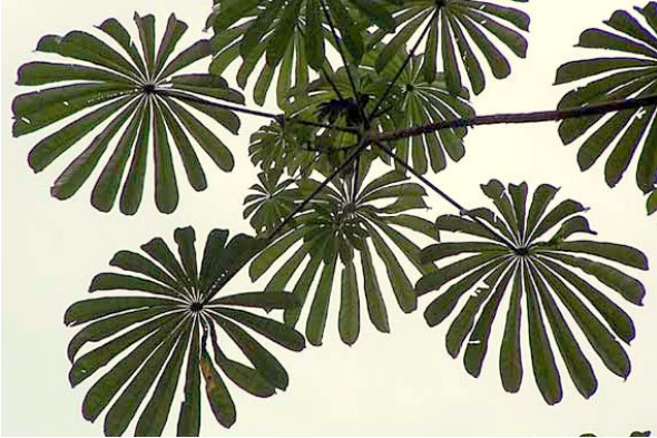
Photo 11. Umbrella tree, Musanga cecropioides

Myrianthus serratus (Trécul.) Benth. & Hook.f.