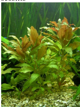
Photo 5. Sessile joyweed, Alternanthera sessilis

AMARANTHACEAE Alternanthera sessilis (Linn.) R.Br. ex Roth. A4