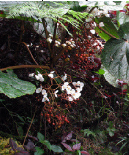
Photo 3. Elytraria marginata