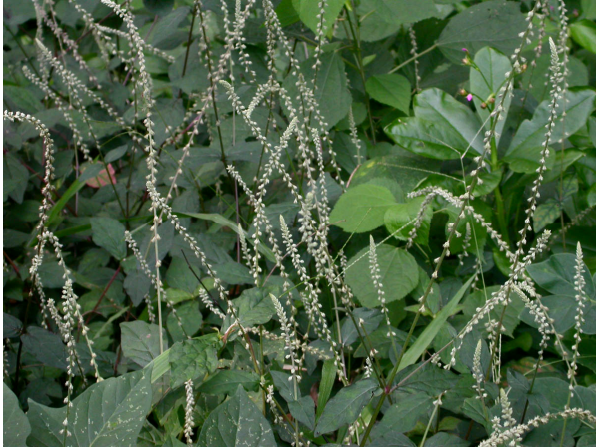
Photo 7. Cyathula prostrata