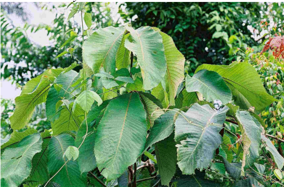
Photo 12. Myrianthus serratus