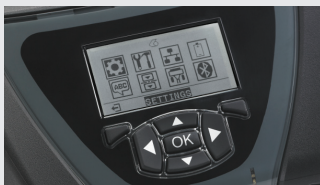
Easy-to-read display with larger, higher-resolution screen