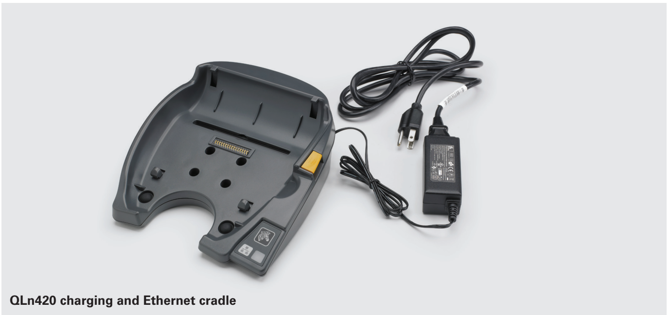
QLn420 charging and Ethernet cradle