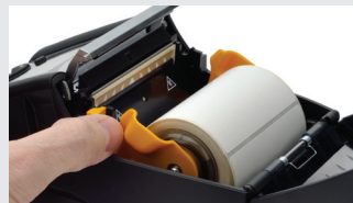
Intuitive peeler operation