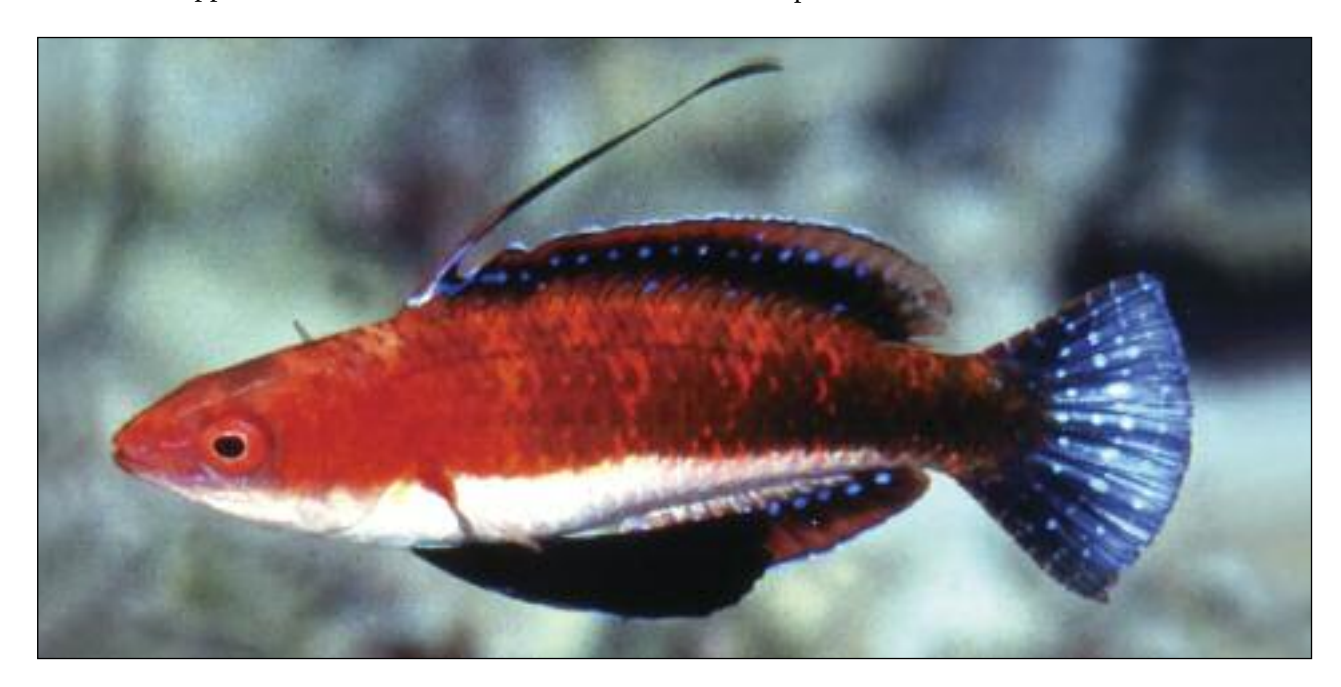
Fig. 6. Cirrhilabrus joanallenae, male, about 45 mm, Weh Island, Aceh Province, Sumatra.

The female phase of Cirrhilabrus joanallenae (Allen, 2000: fig. 2) is very distinctly colored red, abruptly pale blue ventrally, with four longitudinal pale blue lines within the red part of the head and body, the two lower lines on the body dotted. We expect the female phase of C. naokoae to be similar in colour.