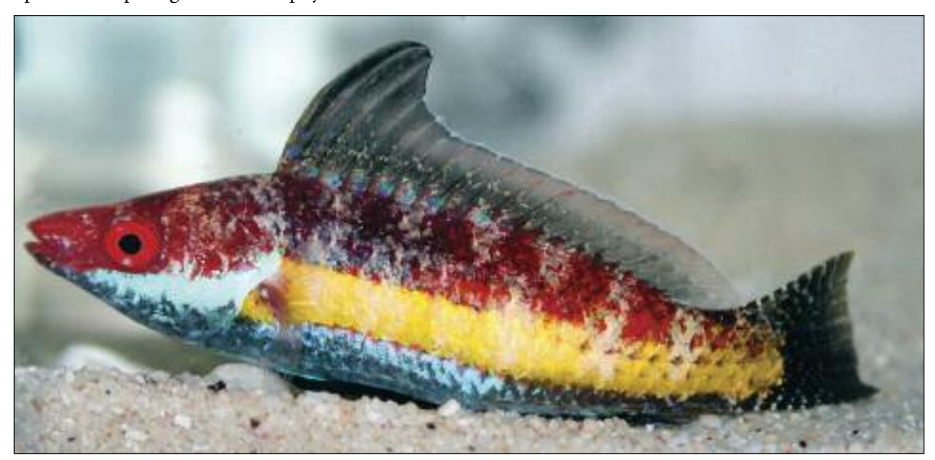
Fig. 3. Fright colour pattern of holotype of Cirrhilabrus naokoae.

Figure 2 is the 55.5-mm paratype showing the light blue color of the membranes of the caudal fin, a variable feature in the same individual. The red of