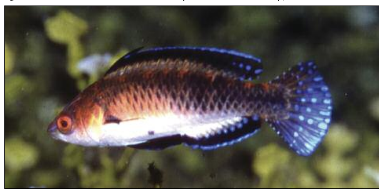
Fig. 5. Cirrhilabrus morrisoni, male, 65 mm, Hibernia Reef, Timor Sea, 30 m.