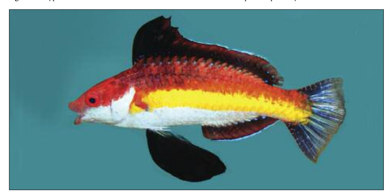
Fig. 2. Paratype of Cirrhilabrus naokoae, male, NSMT-P 91347, 55.5 mm SL.