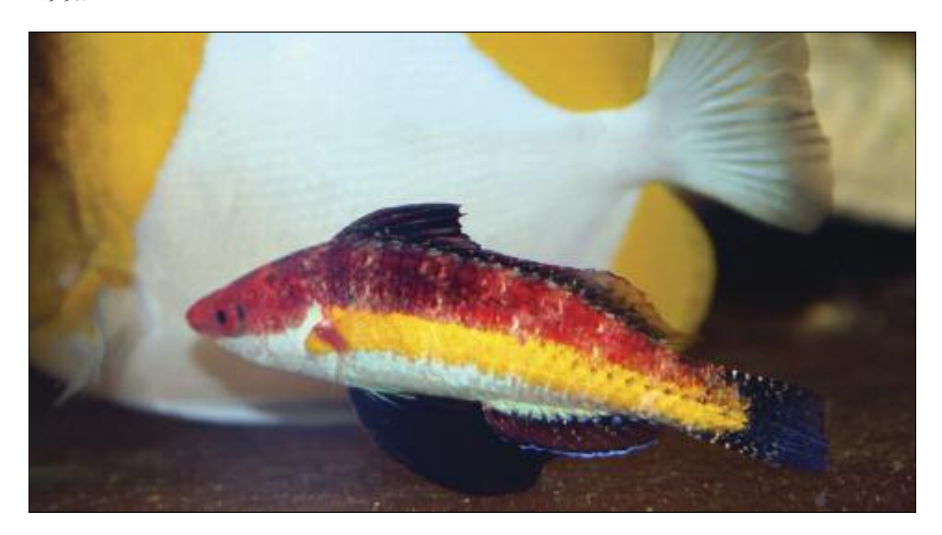
Fig. 7. Cirrhilabrua naokoae cleaning the butterflyfish Hemitaurichthys polylepis.

TEMMINCK, C. J. & SCHLEGEL, H. 1843-1850. Pisces. Pp. 1-345 in: Fauna Japonica, sive descriptio animalium quae in itinere per Japoniam suscepto annis 1823-30 collegit, notis observationibus et adumbrationibus illustravit P. F. de Siebold. A. Arnz & Co., Leiden.