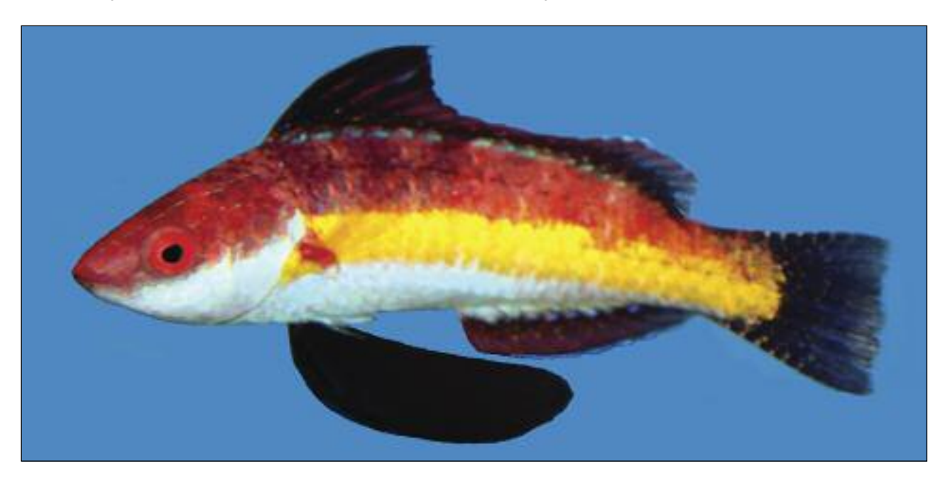
Fig. 1. Holotype of Cirrhilabrus naokoae, male, BPBM 40918, 60 mm SL.

Origin of dorsal fin above base of third lateral-line