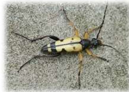
Rutpela maculata Spotted longhorn