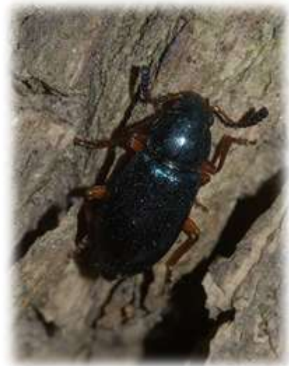
Necrobia rufipes Copra Beetle