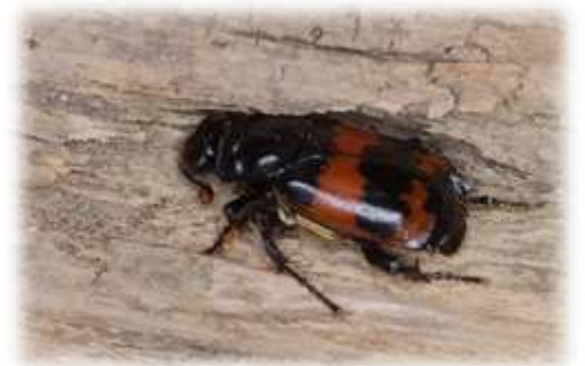
Nicrophorus investigator Banded Sexton Beetle