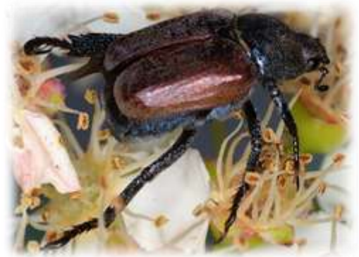
Hoplia philanthus Welsh Chafer