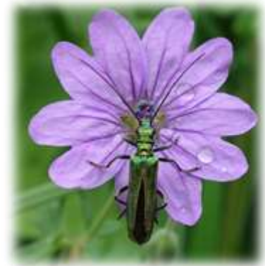
Oedemera nobilis Thick –legged Flower Beetle