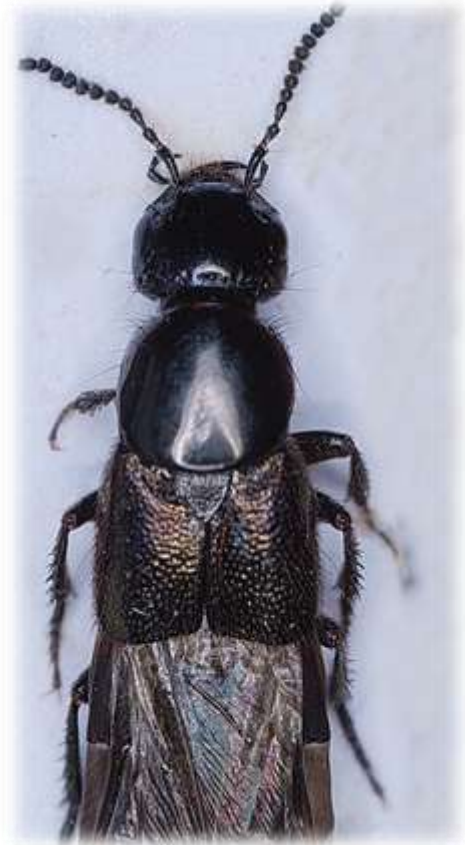
Philonthus splendens The Splendid Rove Beetle