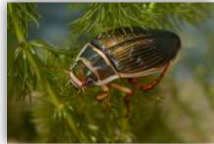
Dytiscus marginalis Great Diving Beetle