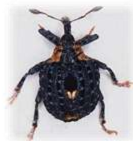
Cionus tuberculosus A Figwort Weevil