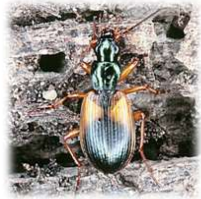
Anchomenus dorsalis Tricoloured Ground Beetle