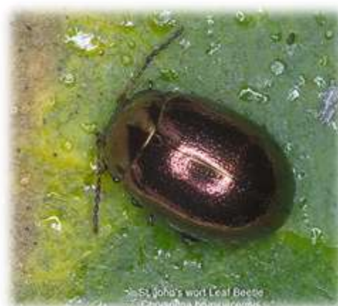
Chrysolina brunsvicensis St John's Wort Leaf Beetle