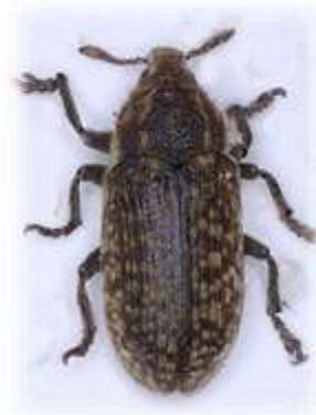
Rhinocyllus conicus Thistle Weevil