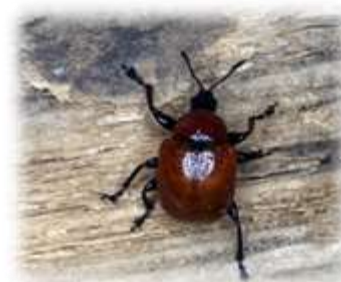
Attelabus nitens Oak Leaf-roller