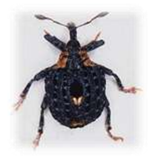
Cionus tuberculosus A Figwort Weevil