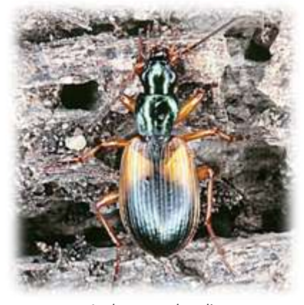
Anchomenus dorsalis Tricoloured Ground Beetle