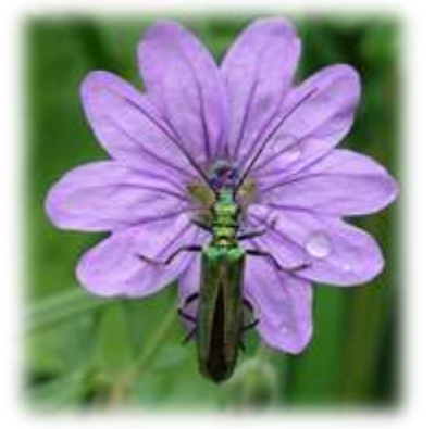
Oedemera nobilis Thick –legged Flower Beetle