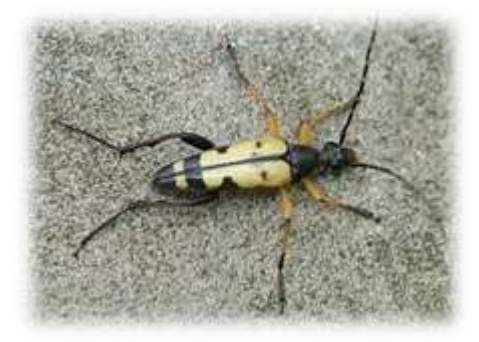
Rutpela maculata Spotted longhorn