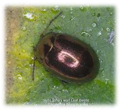
Chrysolina brunsvicensis St John's Wort Leaf Beetle