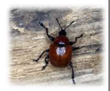
Attelabus nitens Oak Leaf-roller