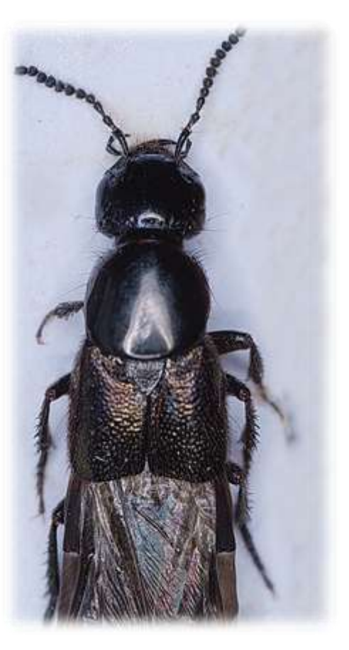
Philonthus splendens The Splendid Rove Beetle