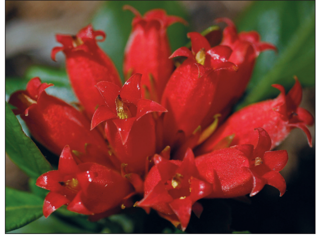
Fig. 1. Flower of Burchellia bubalina.

Corresponding author: R Stewart (ristew@iafrica.com)