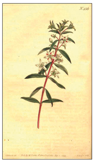
Fig. 3. Longleaf buchu Diosma serratifolia* (Burchell, 1824).

made the next batch of buchu infusion in brandy, 'which faster disappeared than could be accounted for by the wants of my patient'. For 10 days, he washed the hand with the buchu solution twice daily and occasionally thereafter. As soon as the hand began to heal, 'I employed a wash made of a decoction of the leaves of Wilde-alsem (Artemisia afra; Wilde-als; Wild Wormwood)'.