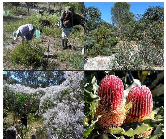
Friends of Forrestdale bush regeneration achievement

In 1993, the Friends of Forrestdale began a regeneration project on land owned by the Western Australian Planning Commission (WAPC) in Commercial Road, Forrestdale, which was cleared long ago by early settlers. Twenty years on, this ~ 1.5ha area is a thriving woodland of species native to the district – hardy species well adapted to growing in impoverished white sand: Menzies, Candlestick and Slender Banksias; Prickly Bark;