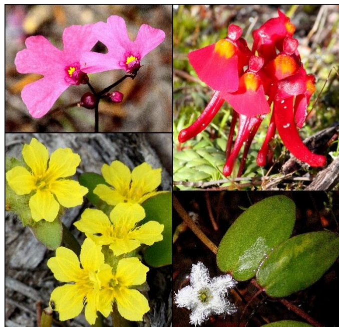
Clockwise from top left: Pink Petticoats; Red Coats; Ornduffia submersa ; Liparophyllum capitatum

multifida ) put on a captivating display; and it's always a treat to find the tiny Red Coats ( Utricularia menziesii ) dotted here and there where the ground is damp. Another special aquatic species at the reserve, Ornduffia submersa , is a small waterlily-like plant with hairy white flowers and oval, glossy leaves that float flat on the surface of the shallow water. This Priority 4 species, endemic to southwest WA, is found south from the Perth region (Kenwick and Forrestdale) to Busselton and Albany. Once the surface water recedes on the clay flats, Marsh Flower ( Liparophyllum capitatum ) bursts into bloom. This small eye-catching dampland plant with golden yellow flowers is also a WA native and occurs from approximately Dongara to Rocky Gully and east to about Narrogin. ✧