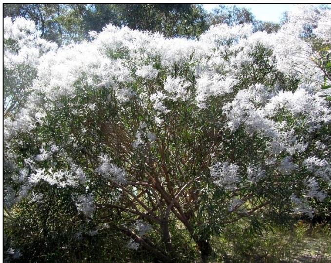
Tree Smokebush ( Conospermum triplinervium )