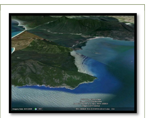
Cape Grafton from the north east

"SUNDAY 10th After hauling round Cape Grafton we found the land trend away NWBW. Three miles to the Westward of the Cape is a Bay wherein we anchord about 2 miles from the shore in 4 fathom water an owsey bottom. The East point of the bay bore S 74° East, the west point S 83° West and a low green woody Island laying in the offing bore N 35° East. This Island lies NBE½E distant 3 or 4 Legs from Cape Grafton, and