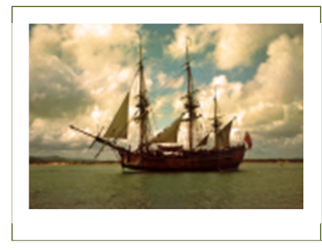
Endeavour replica near Cooktown

is known in the Chart by the name of green Island. As soon as the Ship was brought to an Anchor I went ashore accompaned by Mr Banks and Dr Solander, the first thing I did was to look for fresh water and with that View rowed out to wards the Cape because in the bottom of the Bay was low mangrove land and little probability of meeting with any there, but the way I went I found two small streames which were difficult to get at on account of the surff and rocks upon the shore. As we came round the Cape we saw in a Sandy Cove a small stream of water ran over the beach, but here I did not go in the boat because I found that it would not be easy to land. We hardly advance any thing into the Country, it being here hilly which were steep and rocky and we had not time to viset the low lands and therefore met with nothing remarkable. My intention was to have stay'd here at least one day to have looked into the Country had we met with fresh water convenient or any other refreshment, but as we did not I thought it would be only spending time and looseing so much of a light moon to little purpose and therefore at 12 oClock at night we weigh'd and stood away to the NW having at this time but little wind attended with showers of rain. At 4 oClock the breeze freshend at SBE with fair weather. We continued steering to NNW 1/2W as the land lay having 10, 12 and 14 fathom at the distance of 3 Leagues from the land."