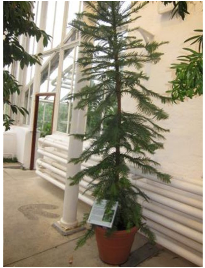
Wollemia nobilis (Wollemi Pine)