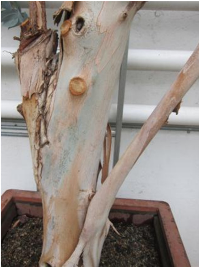
Eucalyptus globulus (Blue Gum)