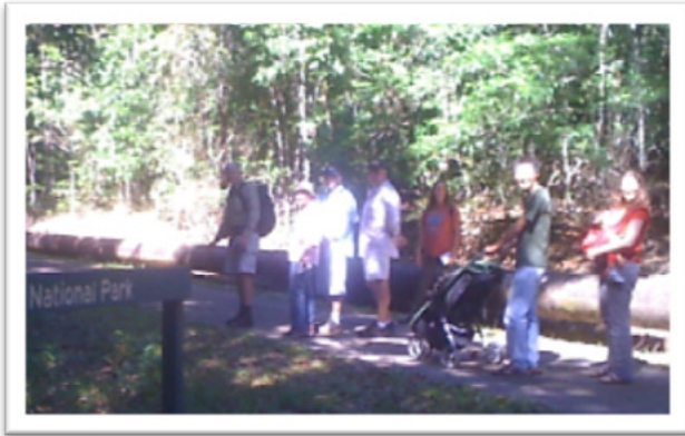
The crew gathering at the start of the walk.

Numerous vine species laced trunks and branches. Hoya australia subsp. tenuipes all along the track gave promise of beauty to come and Jo-Anne, who walks the track regularly, reported that Hoya perfume hangs in the air when they are in flower. Large Faradaya splendida vines made a curtain over a small creek crossing and will be in full flower soon – October Glory is a very apt name for them.