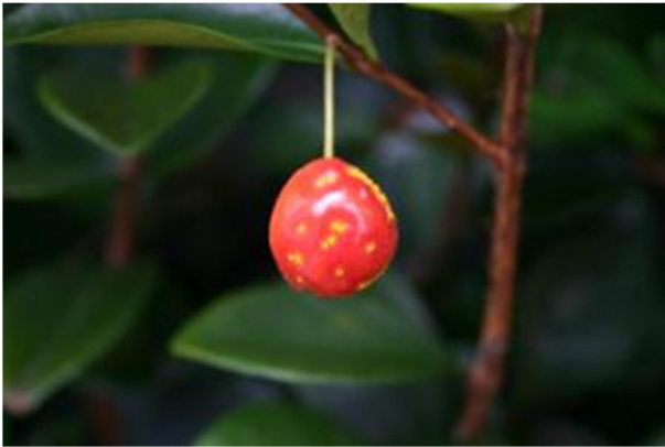
Myrtle Rust on Eugenia reinwardtiana (Beach Cherry)

Betsy Jackes has passed on the following information (from Day Dawn nursery in Townsville) concerning chemical control of Myrtle Rust. The table lists three fungicides that are now registered for use against the disease. Mixing instructions and application rates should be supplied with the chemicals.