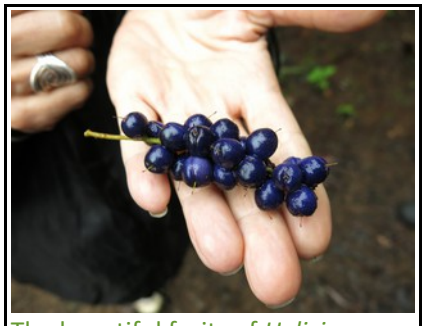
The beautiful fruits of Helicia nortoniana

Preparations for planting had included clearing and poisoning a rampant covering of Singapore Daisy which had formed an impenetrable low mass on the ground. A good attendance of volunteer planters put in over 1 000 seedlings on the day. Our visit was just 16 days later and so far almost all plants are surviving. Weed regrowth in this area is phenomenal, as I know from my own experience at home nearby, and the wide spacing of plants will