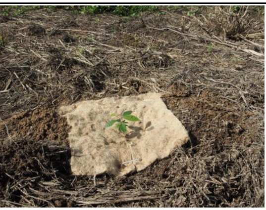
Hessian felt pinned to the ground with wire - a clever way to protect new seedlings from frequent floods along the lower Babinda Creek.

adjoins a massive drain which was formerly Niringa or Cope Creek,