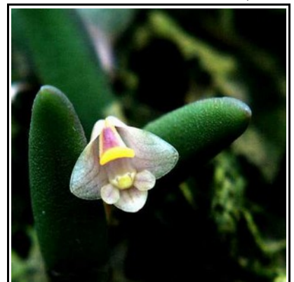
Dendrobium prenticei

We strolled along the track, identifying and discussing numerous plants which ranged from the scrambler Pothos longipes with its leaf blade which extends into a leaf-like flattened stem (to