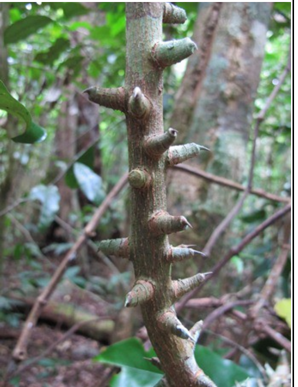
Zanthoxylum nitidum - Cat's Claw Vine

down from the trees in the surrounding forest and make a delicious olfactory end to the day.