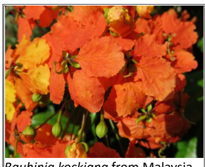
Bauhinia kockiana from Malaysia

Wildlife goes with gardens and a small Jungle Fowl, Megapodius reinwardt was seen scuttling through the undergrowth, while overhead the magnificent local butterflies Blue Ulysses and Cairns Birdwings soared.