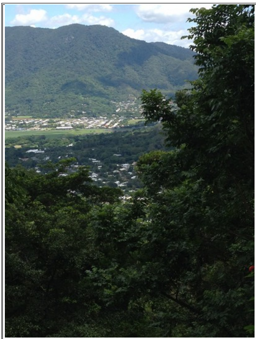
View of Brinsmead and Redlynch from the Green Arrow Walk.

middle of the Blue Arrow walk, and proceeds west, then south west, over the 346 m high peak of Mount Whitfield, and