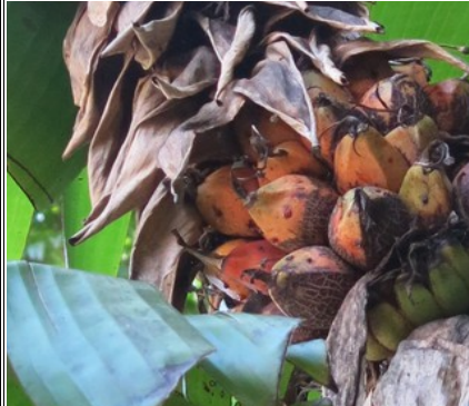
Closeup of fruits - not your regular banana!

of Queensland in a recent "Wellness" magazine, and deservedly so.