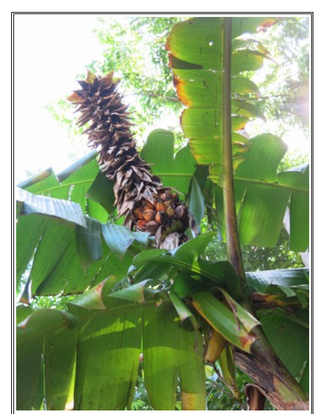
Musa jackeyi fruits and flowers