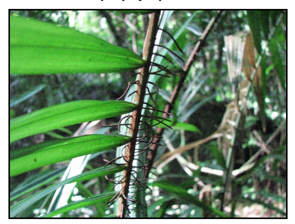
Calamus moti infected with a strange endophytic fungus