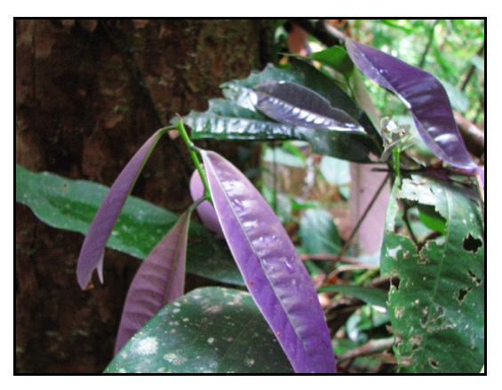
Blue new growth on the Daintree penda.

After leaving the kauri, we continued up the end of the road where it meets the Mossman River. An amazing number and diversity of epiphytes drip from the golden pendas Xanthostemon chrysanthus right here. I've not seen anything like it – orchids, ferns, tassel ferns, ant plants, mosses, leafy liverworts and even trees (umbrella trees Schefflera actinophylla and Fagraea berteronana ). After a brief botanically focussed exploration, and a short but mildly