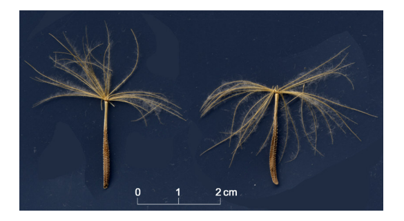
Fig. 4 Seeds of Tragopogon dubius . Harvested in Minami-minowa Village, in August 2018.

Table 2 shows the species composition of the vegetation at the four sites. Most species were herbaceous plants, but the community height differed among the sites; the height was low in Tatsuno and Minowa (0.15 to 0.40 m), high in Minami-minowa and Ina (1.50 m). There were 25 to 45 species per site, and 42% to 68% of the species were naturalized. The ratio of naturalized species was significantly different among the sites (p<0.05, binomial test); the ratio was lowest in Tatsuno (42%), and increased with distance from Tatsuno.