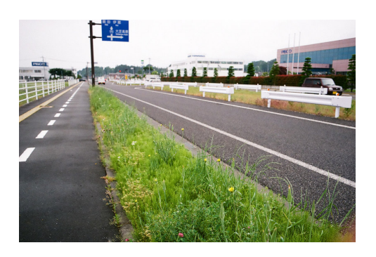
Fig. 2 Naturalization of Tragopogon dubius . Among roadside vegetation in Minowa Town, in May 2018.

on the roadside or cut-slope vegetation (Table 1 and Fig. 2).