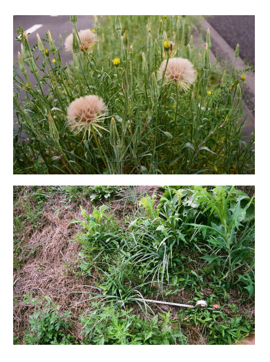
Fig. 3 Growth of of Tragopogon dubius . Top: flower and fruit setting in May 2018. Bottom: tussock-like radical leaves after reproductive growth in August 2018. White scale in bottom figure = 30 cm.

4: in small colonies or extensive patches;