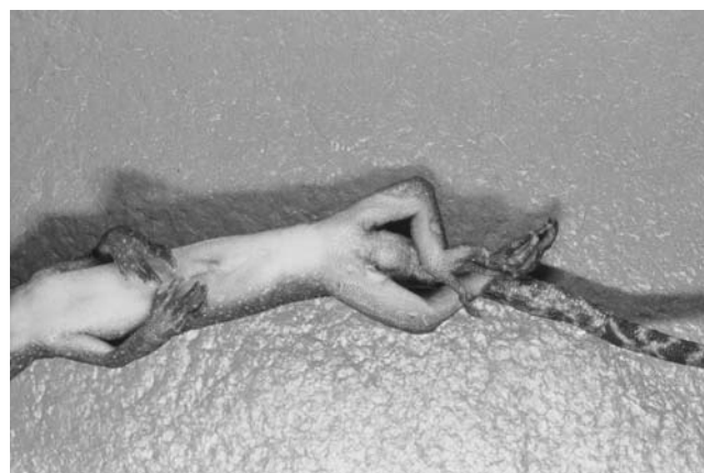
Fig. 4. Cyrtodactylus buchardi , new species. Holotype (MNHN2003.3301). Ventral view.