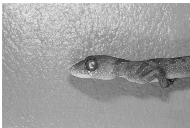
Fig. 1. Cyrtodactylus buchardi , new species. Holotype (MNHN2003.3301). Lateral view of the head (left side).

Habitus. ♂ Juvenile male; SVL: 33.35 mm; Trunk L: 14.30 mm; TaL: 30.85 mm; TL: 64.20 mm; HL: 9.75 mm; HW: