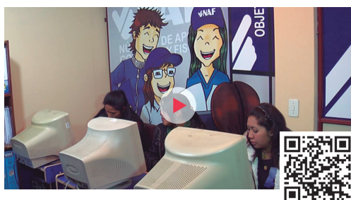
Video: Fiscal Education and Social Cohesion