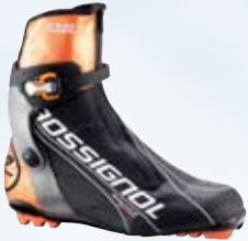
R1010 X-IUM WC SKATE S: 39-49 *