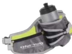
T1775 ONEWAY DRINK BELT W BOTTLE