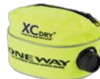
T1780 THERMO BELT XC