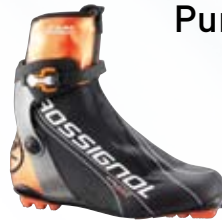
R1045 X-IUM WC PURSUIT S : 36-48,5 *