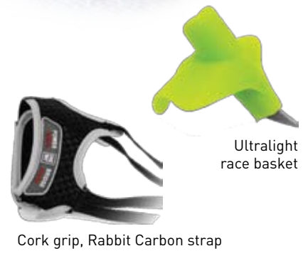
Ultralight race basket

Pole Fitting Tips: CLASSIC : Hold the pole upside down. The basket of the pole should be at shoulder height. SKATE: The pole length should represent 67% of your height (between your chin and nose). *Others criterias can influence the pole length selection. See your dealer to know more.