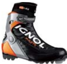
R1410 X-IUM COMBI S :33-42 **