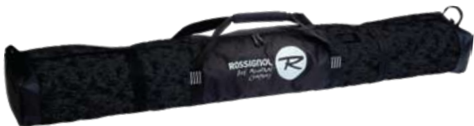
MS1115 LONG HAUL SKI BAG Holds 4 pair XC skis, up to 208 cm