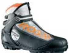
R1420 COMP J S :30-42 **