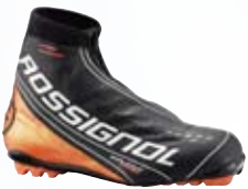
R1030 X-IUM WC CLASSIC S: 39-49 *