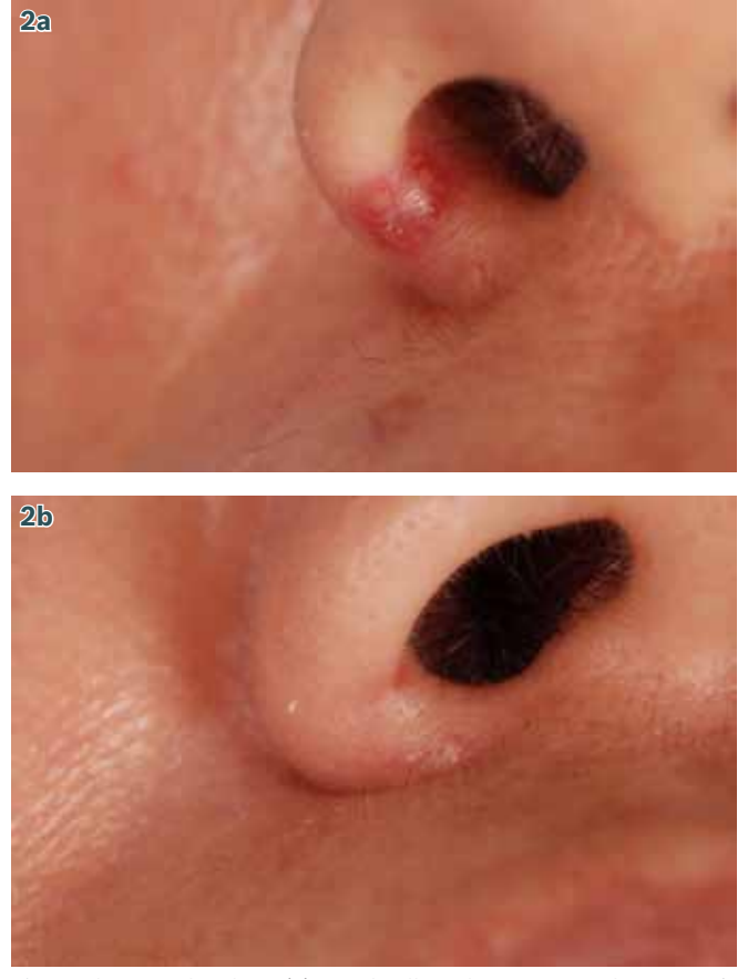
Fig. 2 Photographs show (a) a red-yellowish mass over the patient's right nostril prior to treatment and (b) clearance of lesion after treatment.

detected on otorhinolaryngological examination by an ear, nose and throat (ENT) doctor with a nasoscope. They did not require further reviews with the ENT doctor. There was histological confirmation of the diagnosis in all four cases. Mikulicz cells – large histiocytes with numerous vacuoles containing viable or nonviable bacteria, and Russell bodies – eosinophilic structures within the cytoplasm of plasma cells, were present. The presence of intracellular organisms was demonstrated by positive Periodic acid-Schiff (PAS) and Giemsa stains. K. rhinoscleromatis infection was confirmed with silver impregnated Warthin-Starry stain.