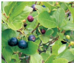
Black Huckleberry

Similar species: Black Huckleberry ( Gaylussacia baccata ) is taller (50 to 200 cm), has smooth fruits and much shinier leaves with rounded ends.