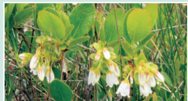
Bell-shaped flowers