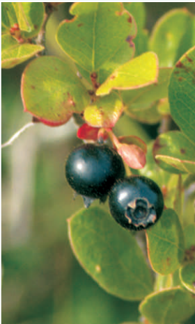
Fruits with soft hairs © ALAIN BELLIVEAU