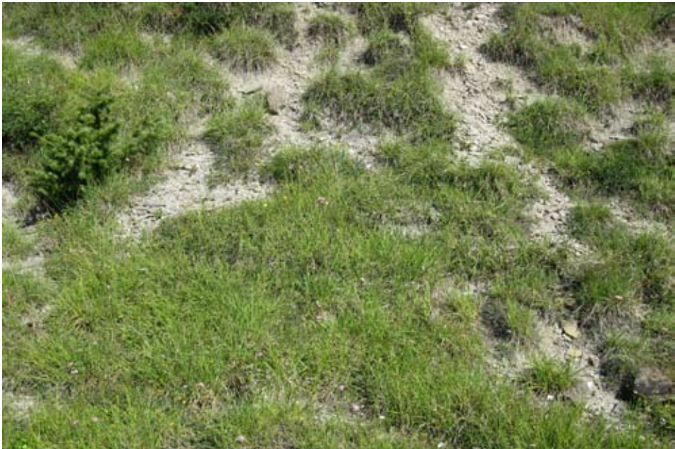
Fig. 3 - A marly-arenaceous escarpment covered by a Sesleria italica plant community (Motolano, 1 July 2015)