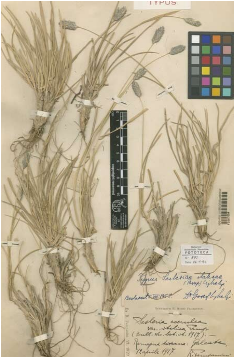
Fig. 4 – Type specimen of Sesteria italica (Pamp.) Ujhely (from Herbarium of Museo di Storia Naturale dell'Università di Firenze).