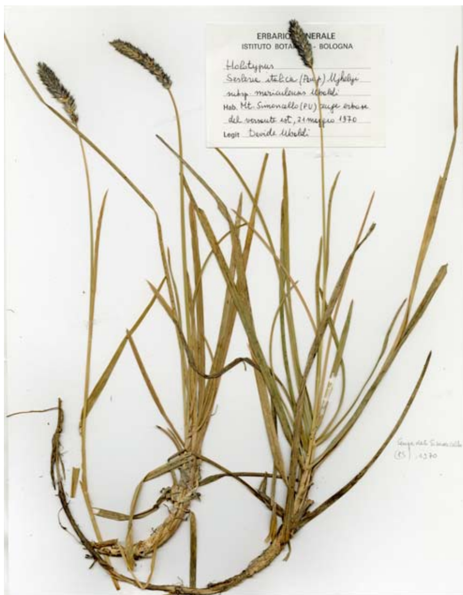
Fig. 5 – Holotype of Sesleria italica subsp. mariculensis (about at the same scale of fig. 4)