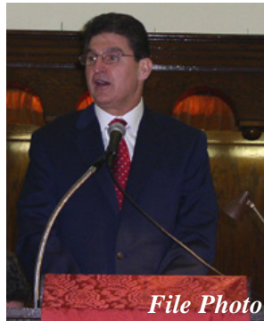
Gov. Joe Manchin III

Most of the revenue enhancements included in this Special Session plan are based upon making sure out-of-State residents who work or profit in West Virginia pay their fair share, eliminating several outdated loopholes or tax credits that are part of our overall tax modernization efforts, and taxing non-healthy food items such as candy, pop, and chips at six percent.