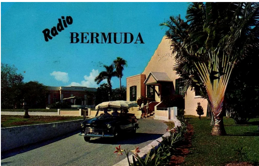
Front page of QSL card issued by ZBM1 1235 kHz ca. 1963.

1450, 1280 and 1160. From the mid-80s, it was the newer Defontes stations that became most common.