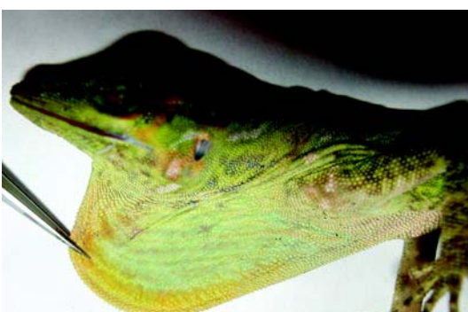
Figure 4 - Dewlap of female A. kunayalae sp. nov.

and lower flanks). Anolis kunayalae further differs from A. mirus in possessing smooth ventral scales (keeled in A. mirus) and scales around the interparietal gradually enlarged relative to temporals and dorsals (abruptly enlarged in A. mirus). Anolis kunayalae further differs from A. parilis in possessing two slightly projecting, enlarged, conical to triangular, keeled middorsal scale rows in males (middorsals smooth in A. parilis) and a distinct temporal line of scales (indistinct in A. parilis). Anolis kunayalae also may be distinguished by its extraordinarily prominent nuchal crest in some males (Figure 1). This trait is not present in preserved A. mirus and A. parilis but we cannot be certain that these species do not possess a distendable nuchal crest in life.