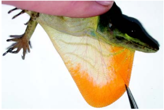
Figure 2 - Dewlap of male Anolis kunayalae sp. nov.