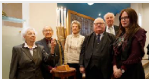
Eric Pickles (front, centre) with four AJR members and the granddaughter of a fifth who, like him, lit a candle on our Six Million Candelabrum

The Holocaust Memorial is due to be completed in 2022.