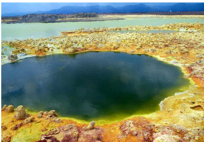
Sulphuric Acid Lake near Dallol

Well, we felt able to stand all that. We were already in Addis Ababa and had done all the negotiations and arrangements to get the two cross-country Landcruisers. That they each lacked at least one wheel nut did not mean they were not suitable for our undertaking. We had to decide in which car we wanted to sit. The red one got the acceptance. It was less comfortable, less clean, the driver's English was poorer, that was true, but still we were able to crank the side windows down and up again which was important for occasionally taking photos and protection against the cold draught or hot dust.