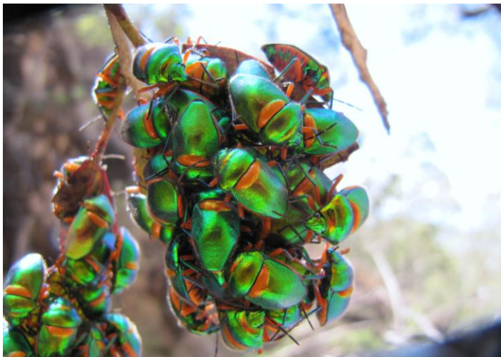
Beetles seen in Butterfly Gorge

Features: Leaves are compound, and bluish or very pale on the underside. In the dry season trees are nearly leafless. Flower colour is variable, with the red flowered form far superior to the yellow form. Long tassels appear quickly after the first storms, with flushing leaves emerging at the same time. Long bean-like pods to 35cm long can persist on trees for many months. The pod is woody and bluish at first. Numerous small hard yellowish seeds are packed cross ways within a leathery packet.