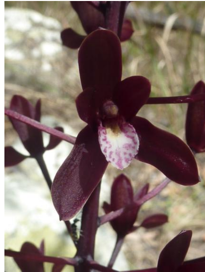
Black Orchid, Channelled Boat-Lip Orchid, Tiger Boat-Lip Orchid Cymbidium canaliculatum

This hardy species grows across northern Australia, most parts of Queensland and northern New South Wales. It is an epiphyte of the open forests and grows high up in ironbark and other eucalypts well above reach of fires. They grow in dense clumps of pseudo bulbs.