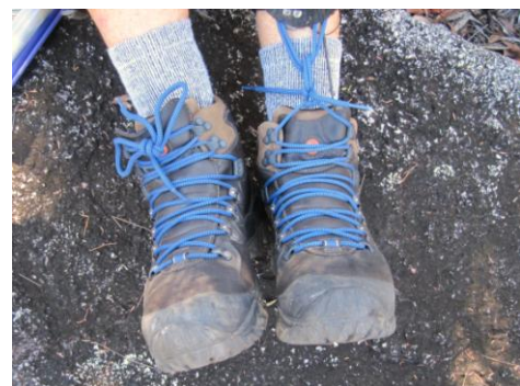
Who's got new shoes?