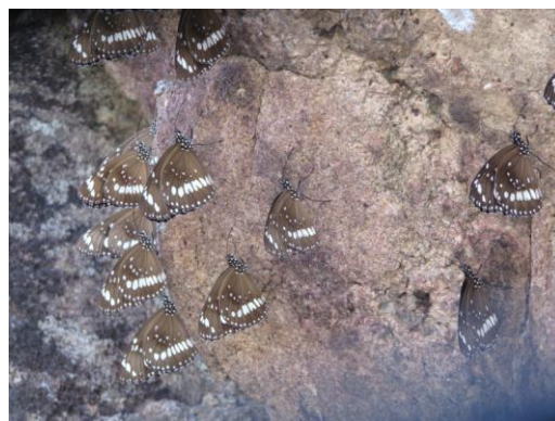
You may get to see thousands of these in Butterfly Gorge.