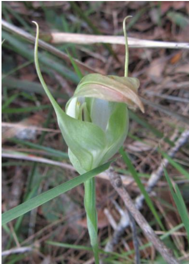
Keeled Greenhood Crangonorchis depauperata (formerly Plerostylis depauperata )

A terrestrial orchid with underground tubers. It has short, ground hugging leaves anywhere from three to seven.