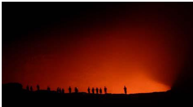
Ah's and Oh's

From the distance I could already occasionally hear voices yelling 'Ah' and 'Oh' and even clapping hands. Finally after carefully moving to the inner rim I could see and hear what is raising the cheer; a gap 15m deep and about 30m wide opens.