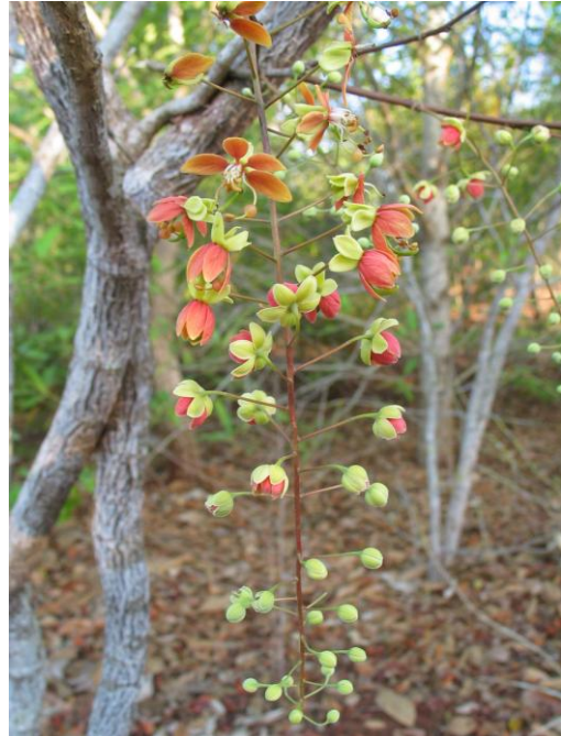
Botanical name: Cassia brewsteri Common Name: Leichhardt Bean

Features: Leaves are large and fat with a very short and swollen stalk. Leaf margin is usually slightly toothed. Impressive shows of long and pendulous pinkish flowers resembling that of Grevillea occur well back from the newest leaves. They have a sweet scent. Large green boat-shaped fruit contain up to 20 white angular seeds. You will be tested on this plant on my next walk....so brush up and impress me!!!