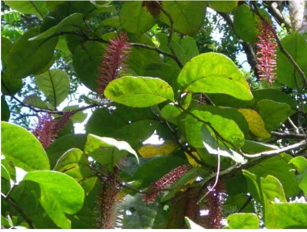
Botanical name: Hollandaea sayeriana Common Name: Sayer's Oak

Sayer's Oak is an inconspicuous small tree or large shrub usually less than 10m high. It is confined to the Wet Tropics where it occurs between about Mt Bellenden Ker and the South Johnstone River from sea-level to 800m. It is only found in the wettest rainforest on a variety of rock types, but appears to be more common on basalt and granite.