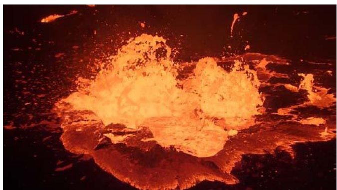
Boiling Lava in the Hellhole

Together with the wind and a really strong stench of sulphur dioxide it becomes hard to take photos at the same time. From time to time I can watch such boiling eruptions here and there throwing glowing lava spatters high up into the air. I indulged very much in this spectacle I have longed for since I got to know about the existence of Erta Ale.