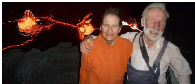
At Hephaestus' Forge

It was an even more scary thing to return to my luggage in the total dark! Several times I cracked through the brittle layer finding one foot half a metre deeper. I pitched the tent on that outer rim. Due to the strong wind this was not very easy to manage. Securing it with some of the many lava rocks around I finally made it.