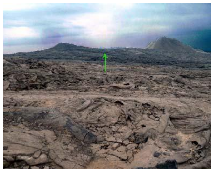
Treacherous Pahoehoe lava

Now I had Erta Ale for myself only. I was alone with the volcano. I was able to circumvent the whole glowing and bubbling hellhole unimpeded by anybody. I could witness most impressive activities of old blacksmith Hephaestus. For me that was by far the highlight of the whole enterprise and of the trip to Ethiopia. I could move around wherever I wished and take photos and videos of those striking eruptions.