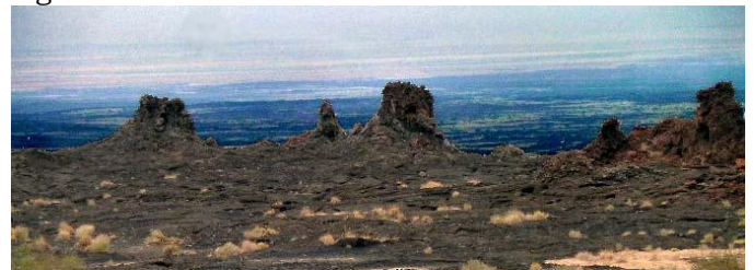
Hornitos ( little Lava Vents)

Usually the way is the goal. However, for me that did not apply here. For me the goal is the goal. Occasionally some 'hornitos' (a few metres high little lava vents not puffing anymore) came into sight.