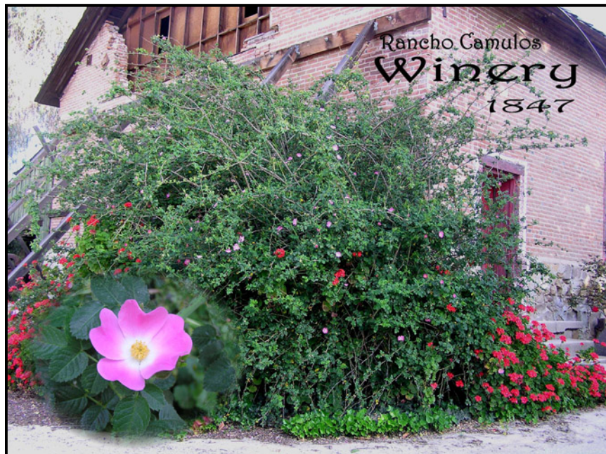
R. eglanteria at a historic site in Southern California

Species and Species Hybrids vary widely. R. eglanteria has proven to be completely hardy – the tips freeze at -35. R. wichurana failed to survive its first winter, though a sub-variant has survived either winters. 'Therese