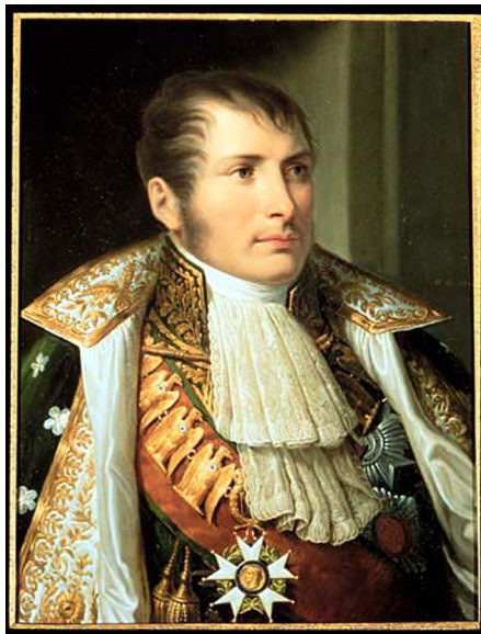
Eugene Rose Beauharnais Prince of the Empire, Arch-chancellor of State Prince of Leuchtenburg, Prince of Eichstadt

In her memoirs, Marie Avrillon, First Lady of the Chamber to Empress Josephine, wrote that Eugene was graceful, athletic, a mannerly gentleman, who was unaffected and kindhearted, “ neither vain nor presumptuous ” and “ sincere without being indiscreet. ” To this might be