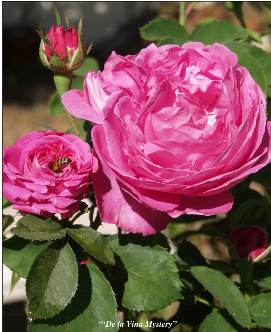
“De la Vina Mystery”

“There is nothing more difficult for a truly creative painter than to paint a rose, because before he can do so he has first to forget all the roses that were ever painted.”