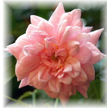
'Mlle. Cecile Brunner'

small cane, maybe 2 feet high. WOW! It practically hit me in the back as I turned away, it grew so fast! Really, within a month it was a small bush, and within 2 months it was a medium sized bush covered with gorgeous tiny pink roses! It turned out to be the bush form of Cecile Brunner. Not a rare rose, of course, but I thought of this particular bush as a family heirloom which had survived for who knows how many decades in very bad circumstances, and then immediately come back to life like Sleeping Beauty.