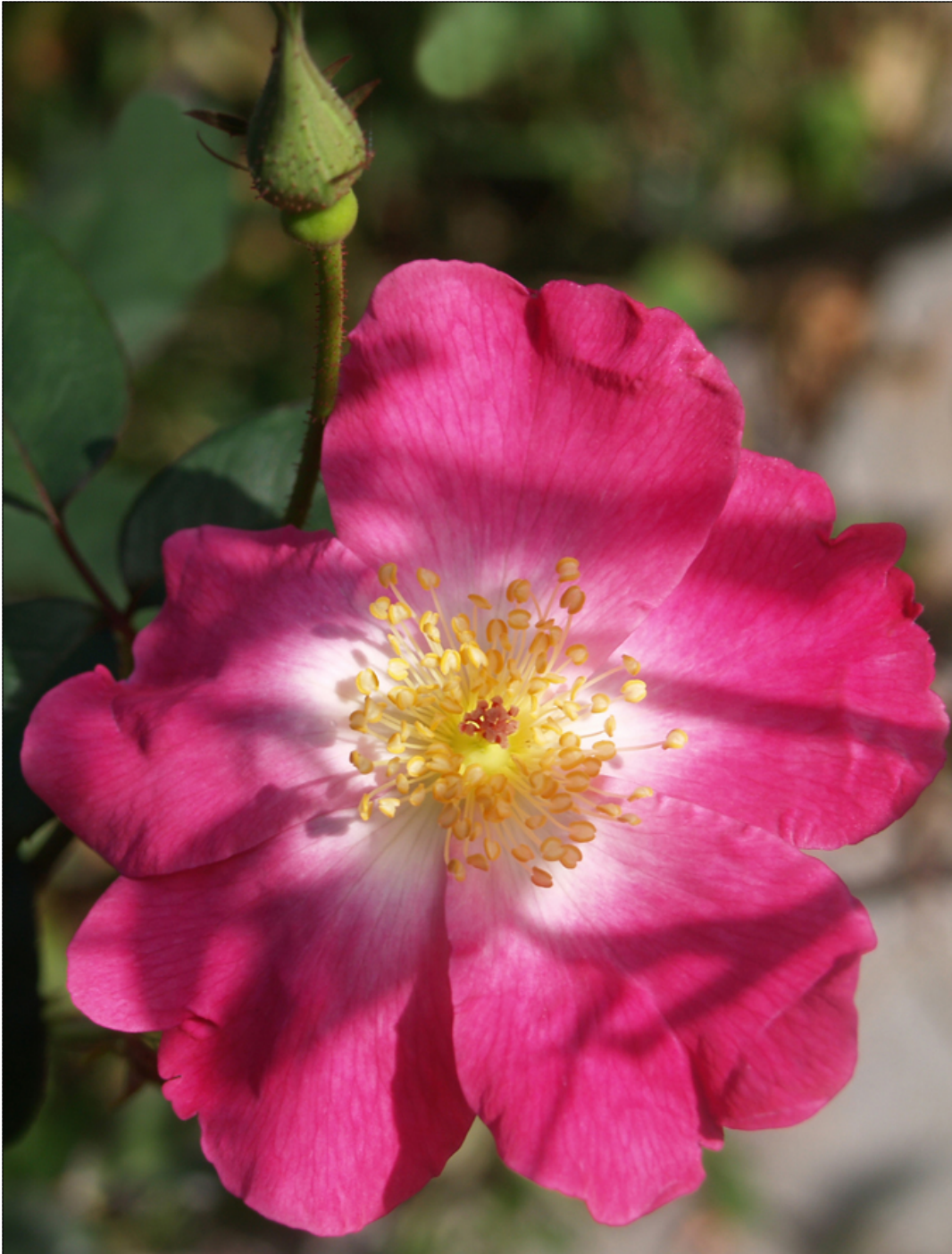
“Single Cerise China”

Probable China Rose, Origin Un-Recorded, San Jose Heritage Rose Garden, San Jose, CA