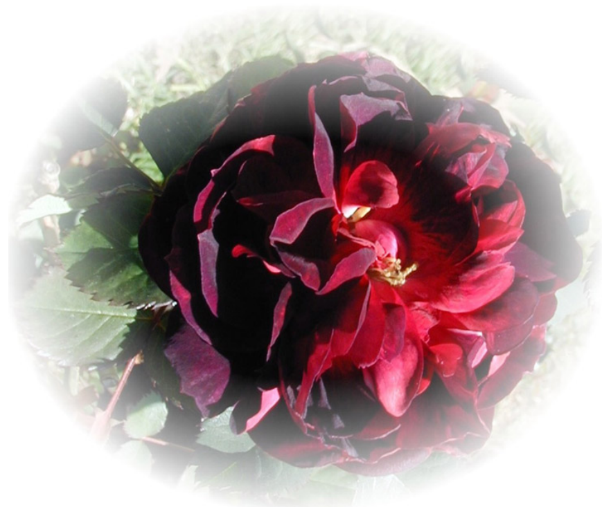
'Eugene de Beauharnais'