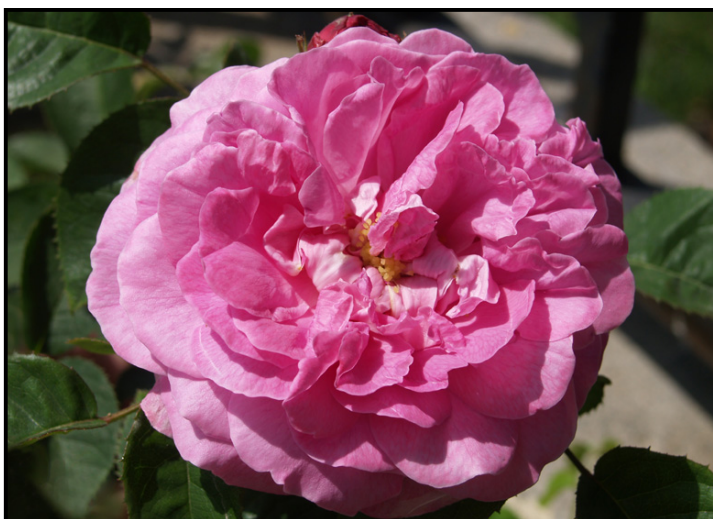
“Linsley Plot Quartered Pink,” A Found Rose Of The ‘Baronne Prévost’ Family

WINTER HARDINESS, Cont. from Previous Page