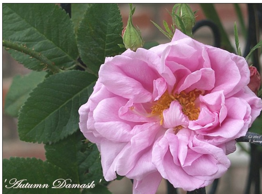
'Autumn Damask' Ancient, Lovely, Well-Adapted To Many Climates — Photographed in Southern California

When we come to the Autumn Damasks and the Portland roses , the situation is very different, since they have proven definitely more tender. 'Four Seasons' will freeze back badly at -20°, and have quite a bit of black-