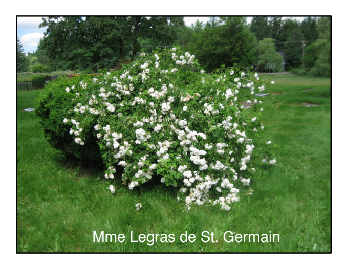
THE ROSES OF DAMASCUS