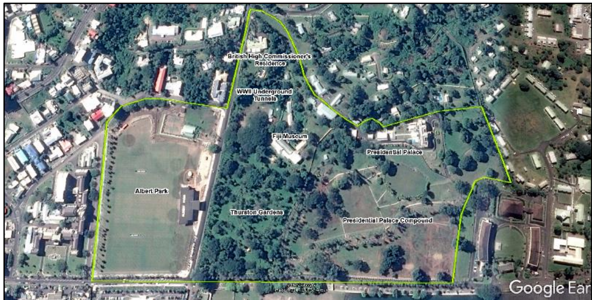
Fig. 2: Location of Fiji Museum. (Google Earth)

Since its establishment in 1904, the Fiji Museum has been governed by two legislations - the Fiji Museum Act and the Preservation of Objects of Archaeological and Palaeontological Interest (POAPI) Act, enacted in 1940. The latter, which is administered by the Archaeology department of the institution, is the legal instrument covering the protection of cultural heritage sites in Fiji. This legislation has a more generalized definition of cultural heritage where underwater cultural heritage sites such as shipwrecks, planes, sunken villages, islands and the likes are not specifically mentioned but in the clause which reads ‘...or any objects of archaeological, anthropological, ethnological, prehistoric and historic significance....’ covers any form of culturally significant sites and objects without distinction of their location. As such the Fiji Museum, Archaeology Department with limited manpower and resources tries to cover all aspects of Fijian cultural heritage.