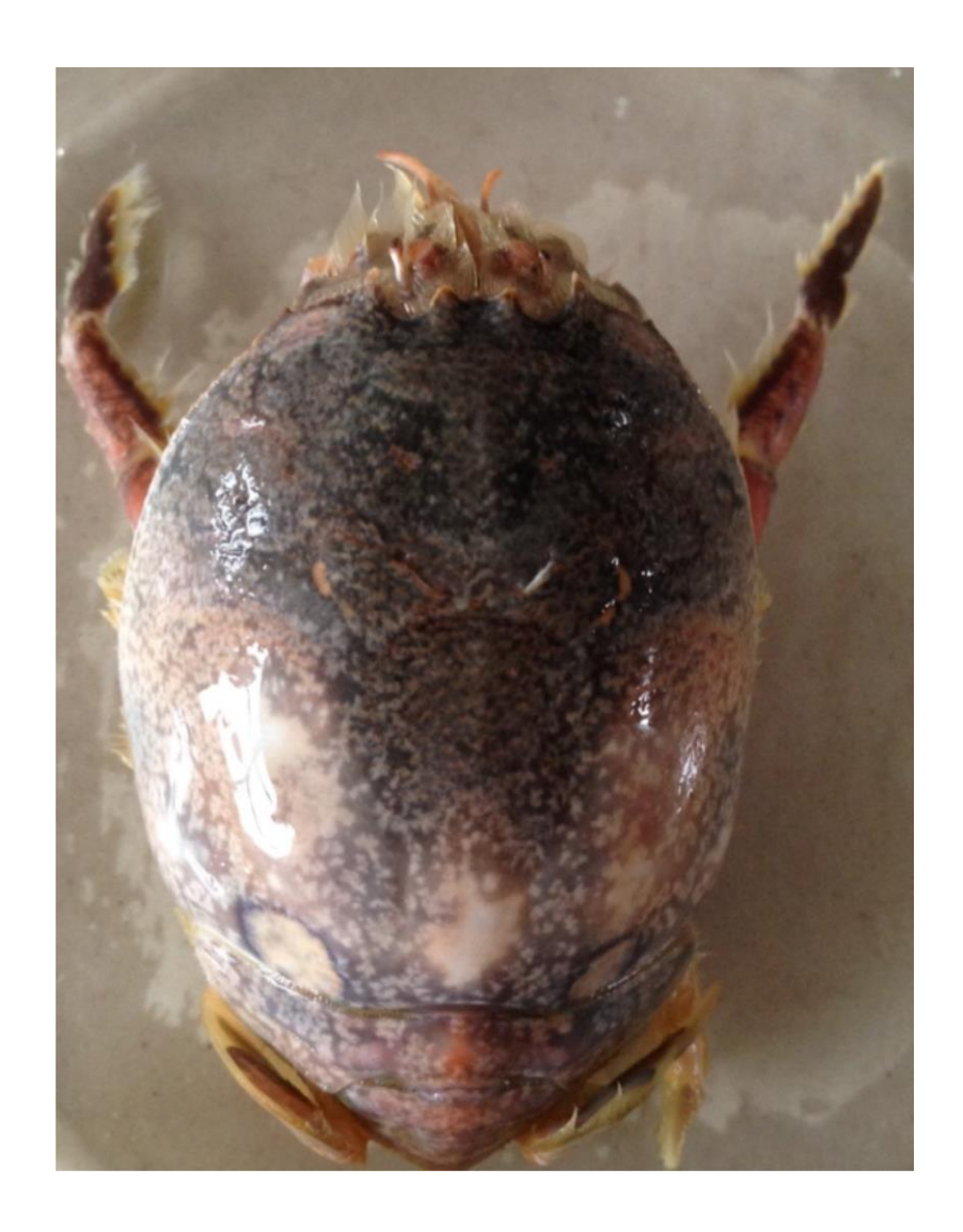
Figure 1: Specimen of H. adactyla (ovigerous female ) from Pelabuhan Ratu, south coast of Jawa, Indonesia.