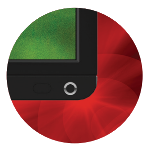
Modern Curved Corner Design in High-Gloss Black and Frame Stand

In a sea of large-screen television choices, the Toshiba 40" L1400U strikes the perfect balance—delivering great picture quality and value, with a slim modern design and elegant new frame stand. Energy efficient with an LED-backlit display, the 1080p Full HD 40" L1400U is equipped with Dynamic Picture Mode for maximum contrast, clarity and color saturation. The L1400U offers DTS TruSurround™ for immersive sound and clear dialog. Everything you need and nothing you don't, the 40" L1400U LED HDTV is the solid choice from a brand you can trust.