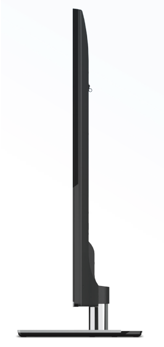
Ultra-slim sophisticated gun metal design, thin bezel and sleek frame stand

Display the small screen content on the big screen quickly and easily