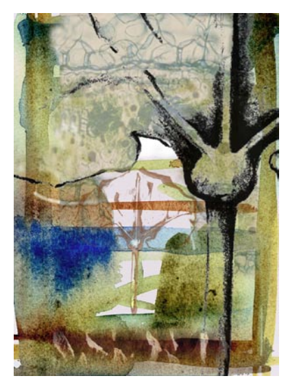
Atriplex stipitata (bitter saltbush), 1999.