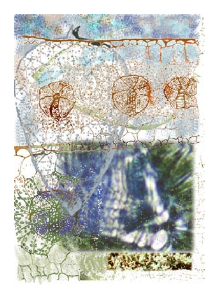
Atriplex holocarpa (pop saltbush), 2000.

Selection of prints from series fruitingbodies 2000 . inkjet prints on archival paper, image size (approx.) 180 x 140mm.