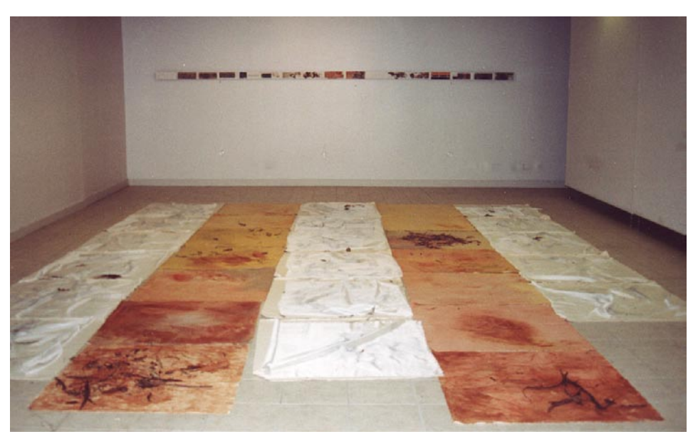
groundcover 2000, FCA Gallery, University of Wollongong, NSW Australia floor: canvas, silk, sand, dry leaves, 500 x 700 cm wall panel: digital prints 10 x 500 x 2-7cm & 3 magnifying glasses