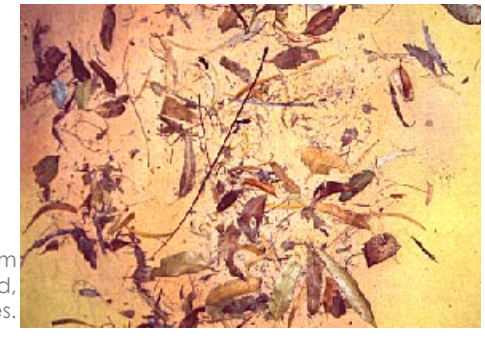
100 x 100 cm canvas, paint, sand, dry leaves.