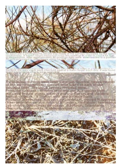
Bassia patenticuspis (spear-fruit copperburr), 2000