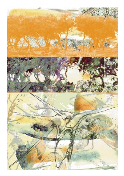
Bassia divaricata (pale poverty-bush), 2000.

Selection of prints from series fruitingbodies 2000. inkjet prints on archival paper, image size (approx.) 180 x 140mm.