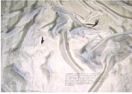
floor detail, 100 x 100 cm canvas & printed silk.