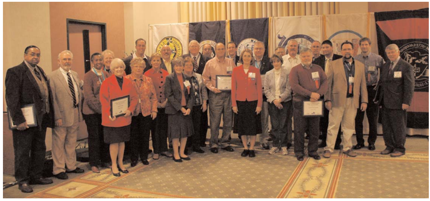
Representatives of the 12 counties that won a 2008 VACo Achievement Award proudly gather for a group photo. For the first time in the program's six-year history, no county won more than one award and an environmental category was added. VACo congratulates all the winners and hopes every county will enter the program in 2009.