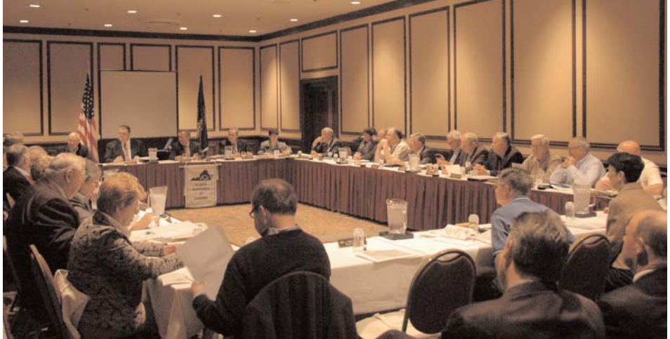
The VACo Board of Directors, among many issues, discussed a new budget policy position recommended by a special committee.

The adopted recommendations included in the 2009 policy statement regarding State and Local Fiscal Sustainability: