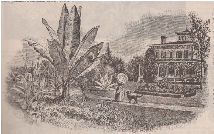
MUSA ENSETE—THE ABYSSINIAN BANANA.