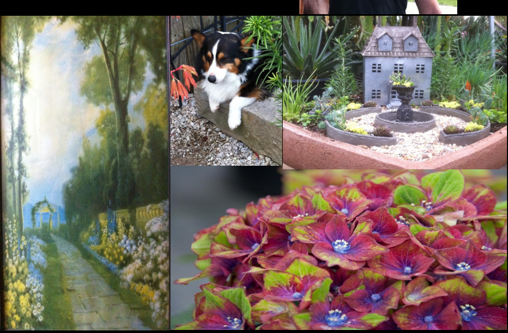
2014 HOURS: Open Daily 9am-5pm March 1-Nov 1 Off Season By Appointment