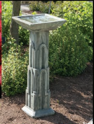
Clockwise: Brugmansia 'Tiffany', Heuchera 'Fire Chief', Art Deco Birdbath, Book Bench, Hortus Head Planter, Epiphyllum 'Unforgettable'