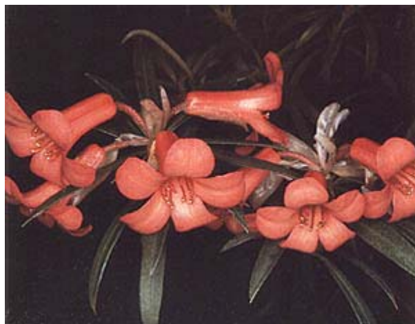
Rhododendron stenophyllum x R.commonae

Both these crosses were made in late 1980 with the aim of producing Vireya hybrids with horticultural value and increased cold tolerance from R.commonae . Both hybrids have attractive foliage and flowers, but as yet their cold hardiness has not been assessed.