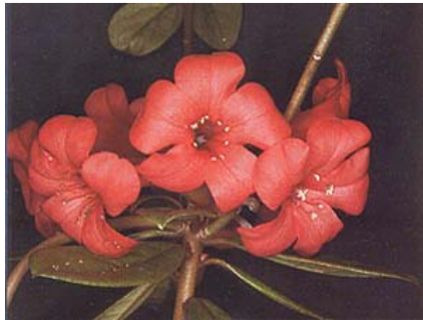
(Rhododendron konori x R.laetum) x R.commonae

are long and very narrow with a ratio of length:width of 25:1. When this species is used in hybridization the shape of the leaves of the small seedlings can be used to confirm true hybridity at an early stage. The photograph shows R.stenophyllum growing in a glasshouse at the Royal Botanic Garden, Edinburgh.