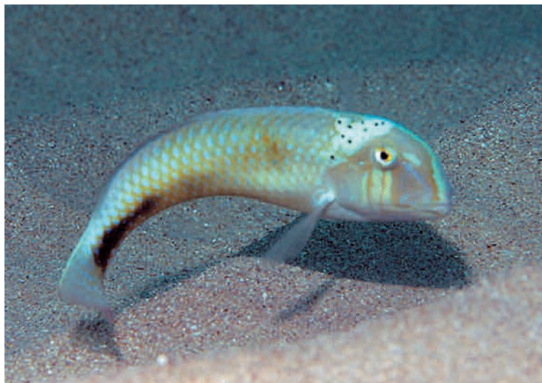
Fig. 3. Iniistius griffithsi , presumed male, same locality as Fig. 2.