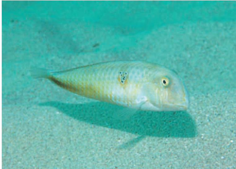
Fig. 2. Iniistius griffithsi , presumed female, Loky Bay, northern Madagascar.