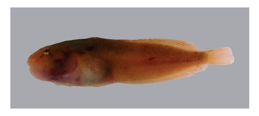
Fig. 2. – Photograph of the fresh Liparis montagui specimen caught in BPNS.

During our long-term monitoring programs, regular beam trawl samples have been taken for over 20 years on the Belgian part of the North Sea. These data showed that L. liparis is a common species throughout the area (4) while L. montagui was never observed (pers. obs.). There was uncertainty about the possible observation of L. montagui during a sampling campaign on September 24th, 2007 (4 years prior to the reported observation), but unfortunately due to the inferior condition of the specimen we were unable to make a straightforward identification. Hence, the recording of March 9th, 2011 is considered to be the first official reported catch of L. montagui for the Belgian marine waters. Since then, L. montagui has been reported from Belgian waters by Hans De Blauwe (12) at the marina of Zeebrugge and by Kelle Moreau (pers. comm.) at the coastal zone of Nieuwpoort, the latter caught on September 9th, 2013 from R.V. Simon Stevin with a 6 meter shrimp beam