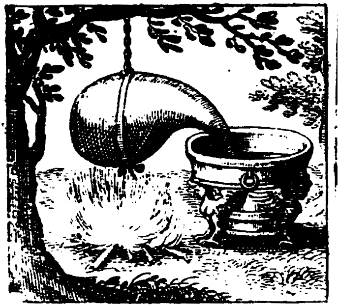
Fig. 1: The inverted-glass-experiment as represented in: Drebbel C., Kurzer Tractat von der Natur der Elemente und we sie den Wind, Regen, Blitz und Donner veursachen und war zu sie nutzen (1608).

Under the action of fire, air becomes like fire, water like air and earth like water.<sup>73</sup> Fire 'is the life of everything' and it is thanks to the fiery action of the sun on air and on the other elements that plants and animals live.<sup>74</sup> In Drebbel's explanation of weather, the interplay between fire, air and water was very important, as it is also in modern meteorology. In the fourth chapter, Drebbel explained wind and rain by saying that the sun made air similar to fire and water to air, so that the two would rise and move around spreading humidity.<sup>75</sup> Eventually, when air-like water had risen up to where the air was cold, it turned again into water proper and fell down. At this point the air stood still. The way in which fire caused wind was demonstrated by way of the inverted-glass experiment, which was shown in the only picture appearing in the treatise [Fig. 1]: