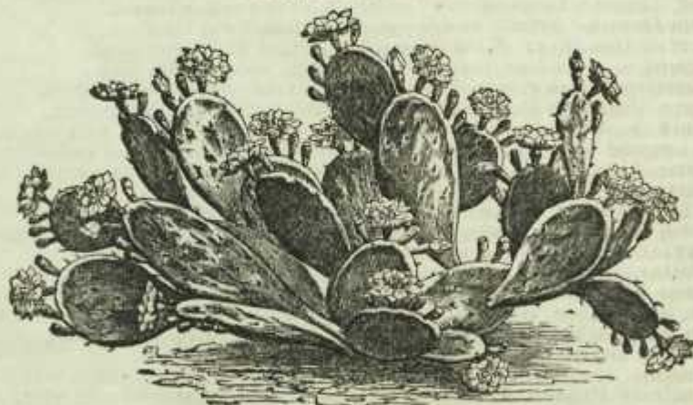
OPUNTIA RAFINESQUINA. A hardy species of Cactus.