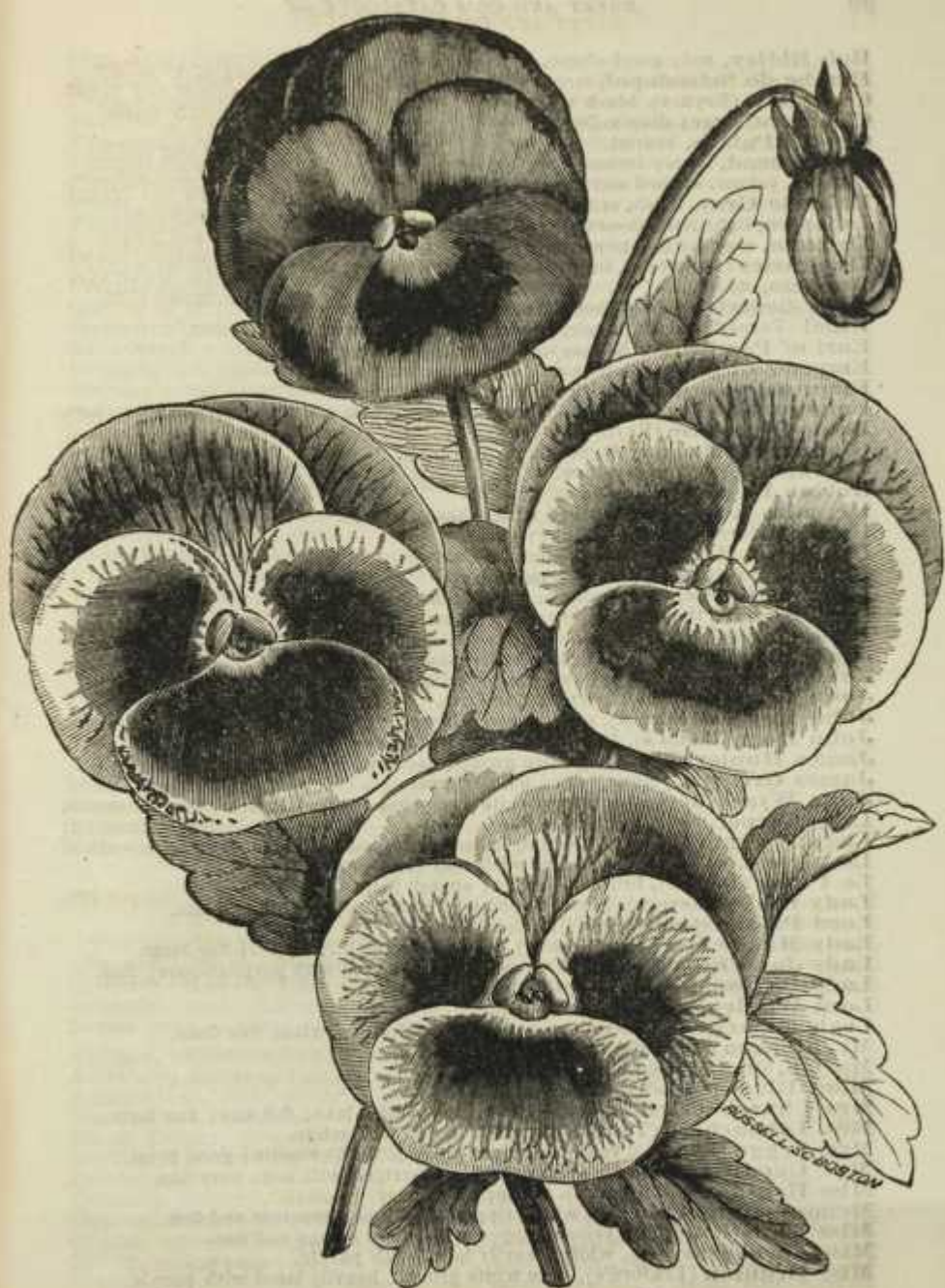
LARGE ENGLISH PANSIES. See page 54.