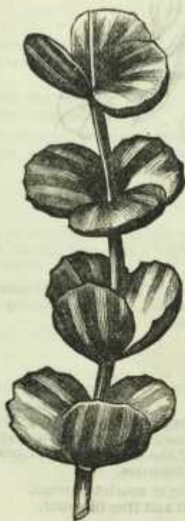
SEDUM SIEBOLDII VARIEGATUM.