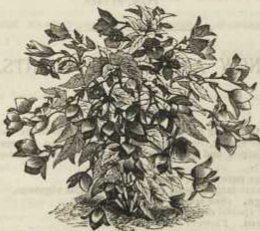
NEW TUBEROUS-ROOTED OR BEDDING BEGONIAS.