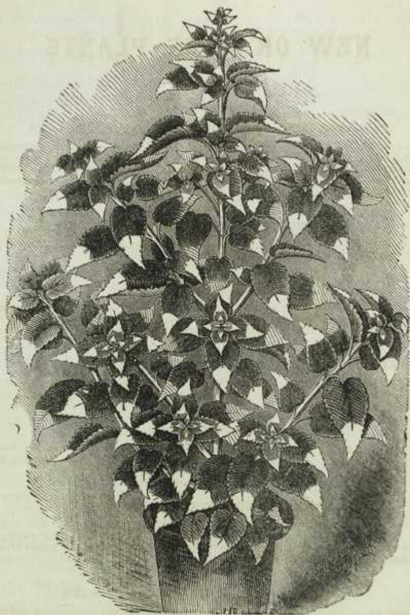
COLEUS, LADY BURRILL.