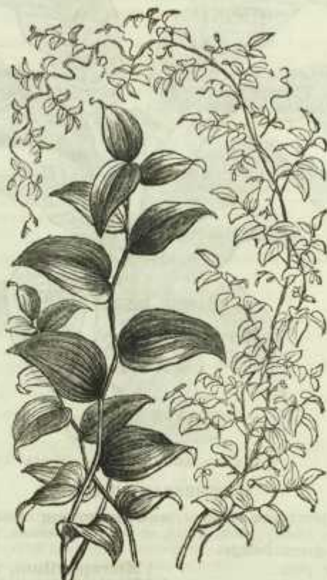
MYRSIPHYLLUM OR SMILAX.

One of the most delicate and beautiful of all winter climbing plants, growing rapidly, and covering a wall or trellis in a few weeks. The foliage is small, smooth, and glossy, and for bouquets or wreaths, or for table decoration, surpasses every other plant. Price, 20c. each; $2 per dozen; $15 per hundred.