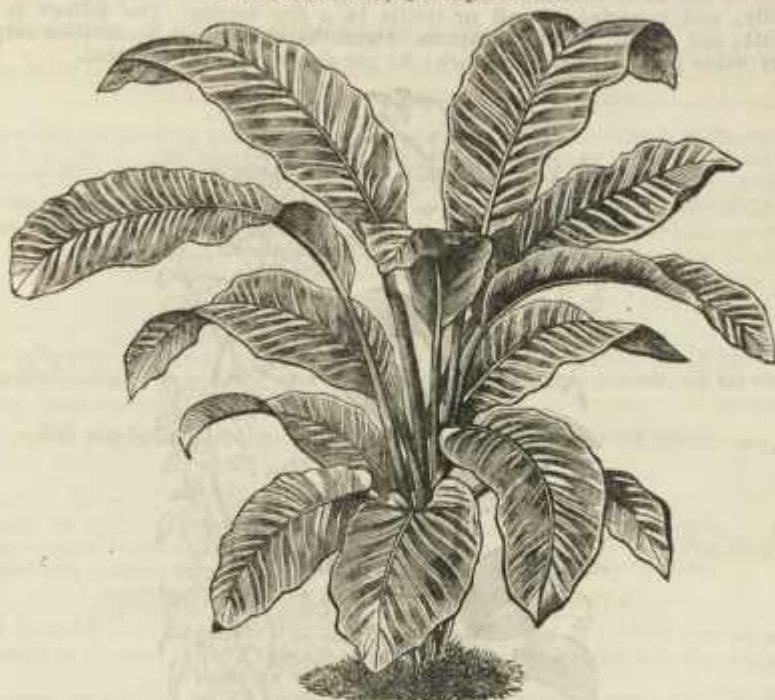
MARANTA ZEBRINA. (See page 34.)