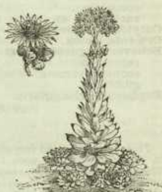
SEMPERVIVUM ARACHNOIDES. (Page 61.) SEMPERVIVUM TECTORUM. (Page 61.)