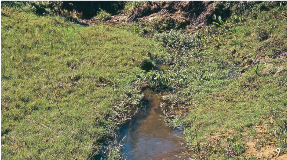
Fig. 7. Phallotorynus victoriae ; Paraguay: Neembucú, near Pilar, rio Neembucú drainage, aquarium specimen, male.