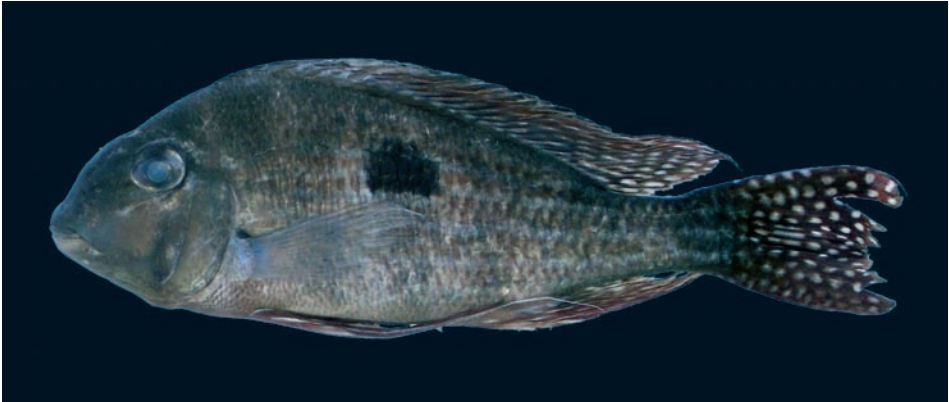
Fig. 1: Geophagus gottwaldi sp. n., holotype, MTD F 30394.

Scales on body and nape ctenoid; cheek and prepelvic scales cycloid. Anal, pelvic and pectoral fin naked. Dorsal fin with minute scales along its base. Caudal fin densely scaled up to \frac{4}{5} of its length in its upper and lower parts; middle of caudal fin scaled only at its base. Jaw teeth unisupid, slightly recurved. Teeth in outer row larger than those of inner rows. Outer row with 14–24 teeth.