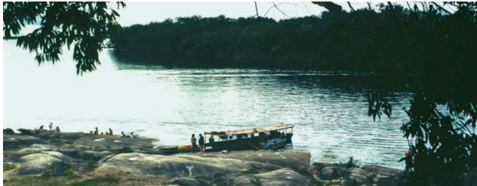
Fig. 2. Collecting site of Geophagus gottwaldi sp. n. at the río Atabapo in the vicinity of San Fernando de Atabapo.

Fig. 3. Live subadult Geophagus gottwaldi sp. n. from the río Atabapo, approx. 15 cm TL, immediately after capture in a photographic tank.