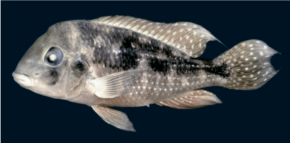
Fig. 1. Gymnogeophagus caaguazuensis sp. n., holotype, two months after fixation, MTD F 30367.

steep and straight (save for small concavity above anterior half of orbit); body contour at base of dorsal fin only slightly arched. Ventral head contour with slightly inclined straight lower jaw and straight sloping posterior section. In females dorsal and ventral outline evenly arched from snout to last dorsal fin ray, respectively to first anal fin ray.