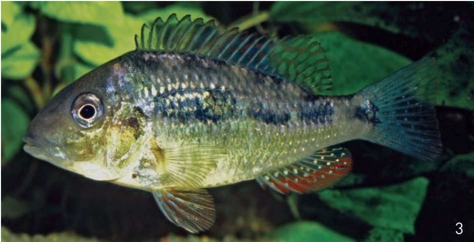
Fig. 2. Live topotypic adult male of Gymnogeophagus caaguazuensis sp. n., approx. 10 cm TL, photographed in aquarium; not preserved.