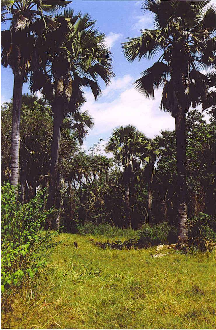
Fig. 4. Borassus stand along the Sima River