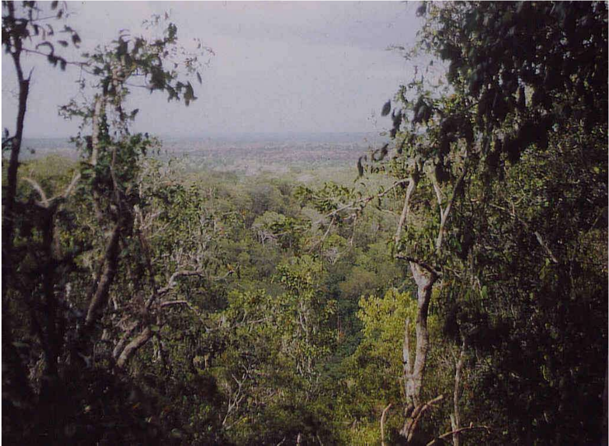
Fig. 6. Kwamsisi Forest