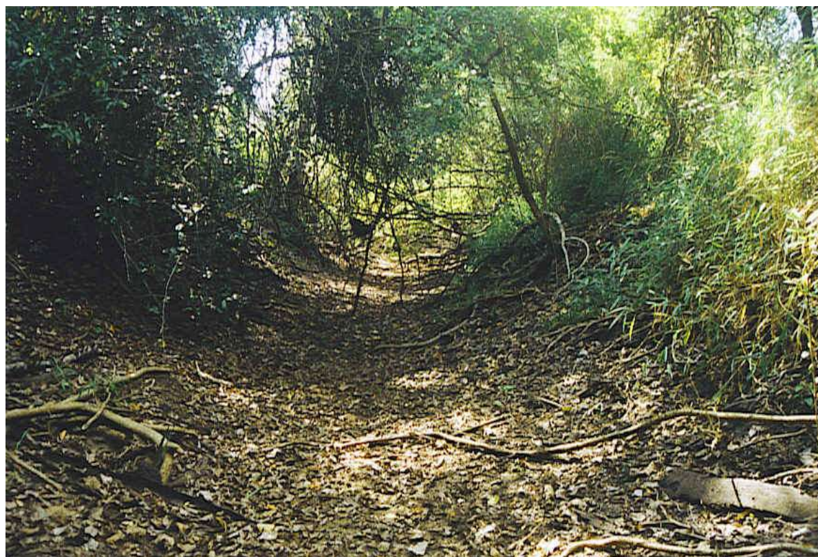
Fig. 5. Msangazi gallery forest (Mkwaja North)