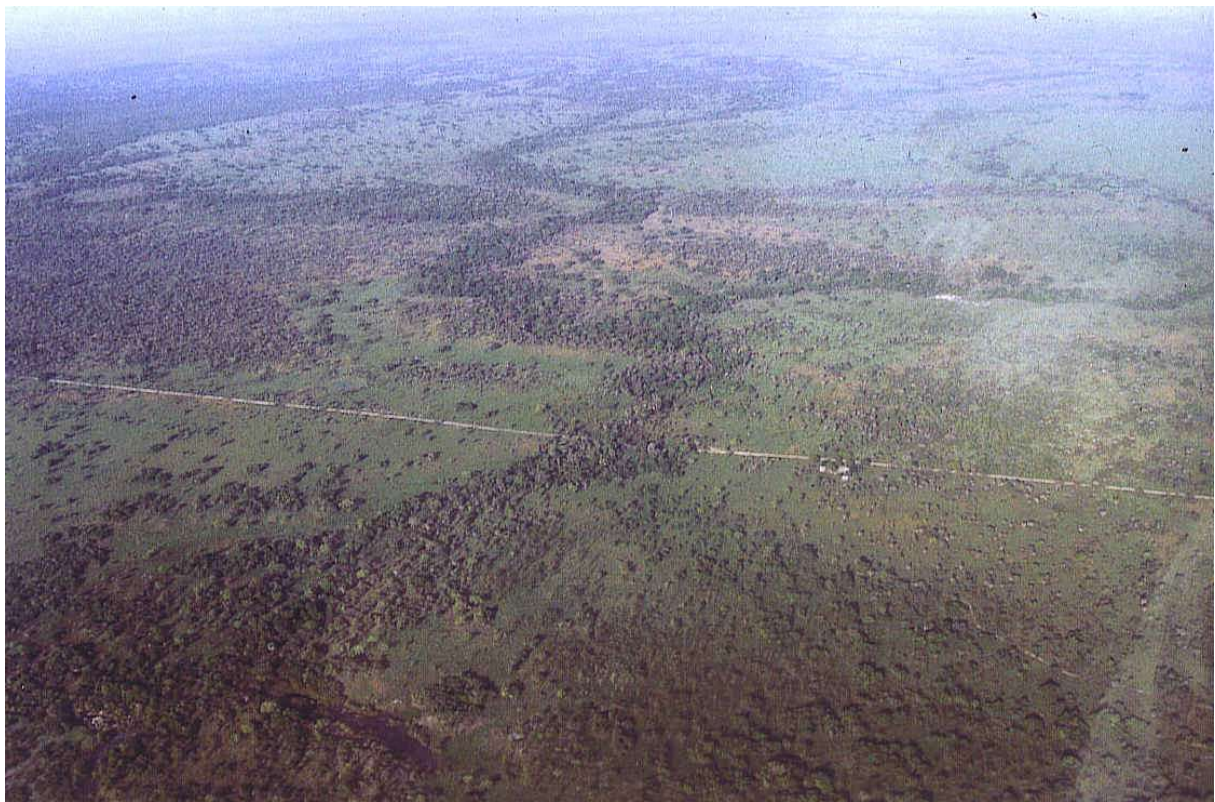
Fig. 1. The Saadani forest-savanna mosaic

Due to disturbances, in particular by humans and elephants, parts of some forests could be considered as scrub forest (White 1983), but since their extent is small and regeneration is quite rapidly (if there are no further disturbances), we prefer to conceive them as forests. Our vegetation communities like those of Hawthorne (1993) and Clarke & Robertson (2000) are descriptive and have not been defined statistically lacking sufficient data. The relevés of the 24 different coastal forests will be published in a scientific journal.