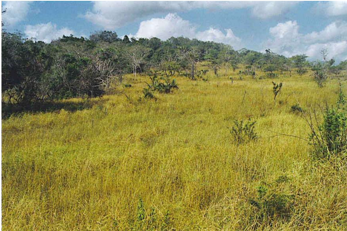
Fig. 2. Small hilltop forest at Mkwaja North

Hillocks are a common feature of the Saadani National Park. Usually their top and the upper part of the slopes are covered with low forests composed of mostly gnarled trees. This forest type usually extends over 1 to 5 ha often having gaps due to elephants. Hilltop forests have the driest substrate of all coastal forests. Almost each small hilltop forest has its own dominant species as shown in Table 1 below.