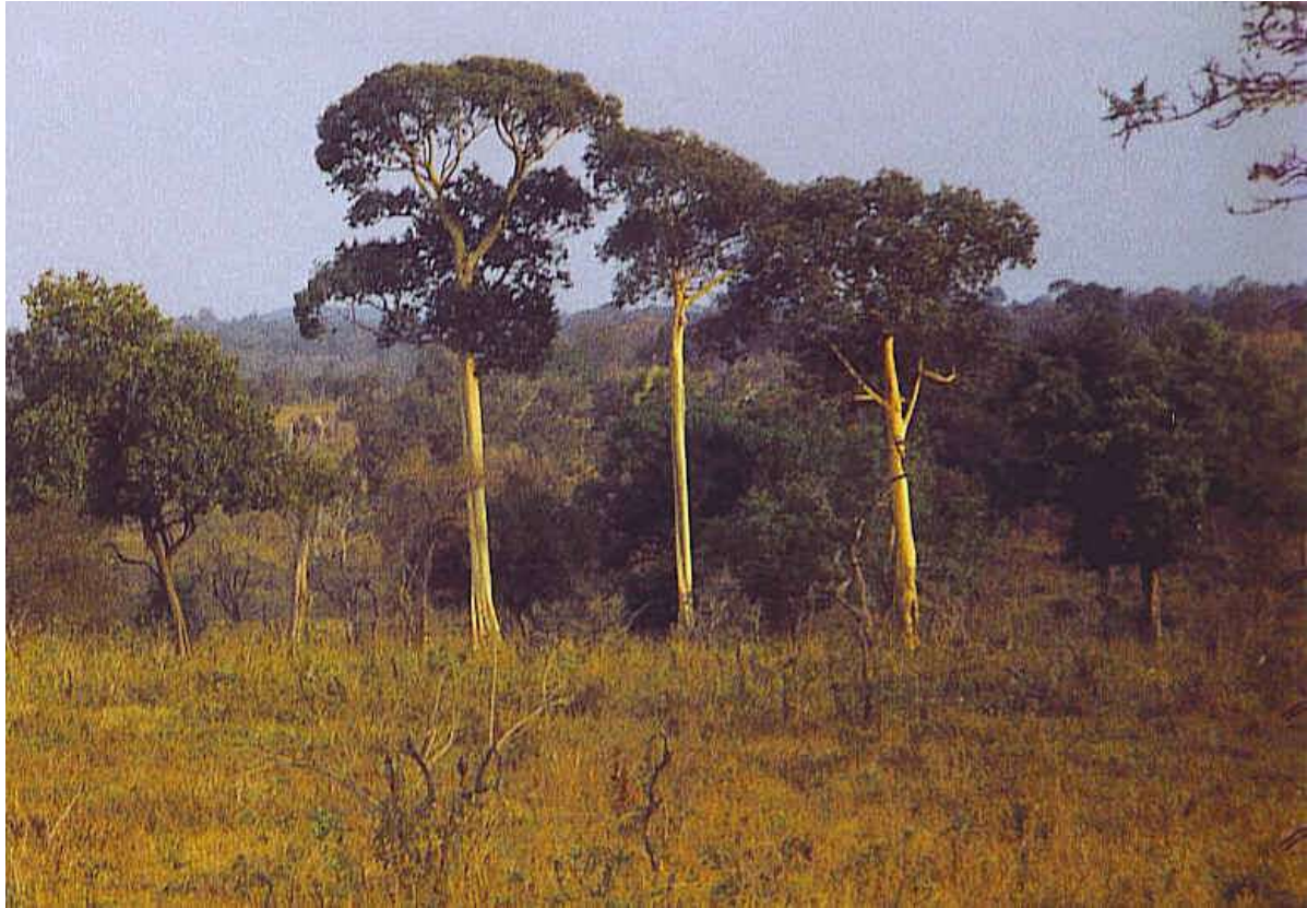
Fig. 7. Sterculia appendiculata near Mkalamu