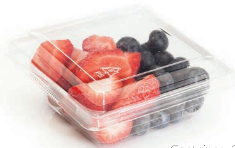
Container- 21828 Lid - 29332