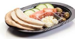
Platters Page 16