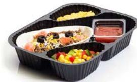
Entrée & Multi Purpose Trays Page 13-14