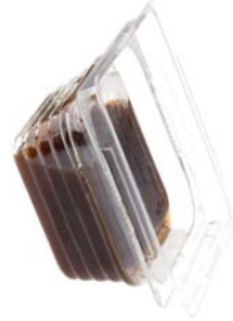
Container- 21482 Lid - 21482L