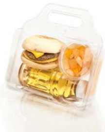
Hinged Clamshells Page 10-14