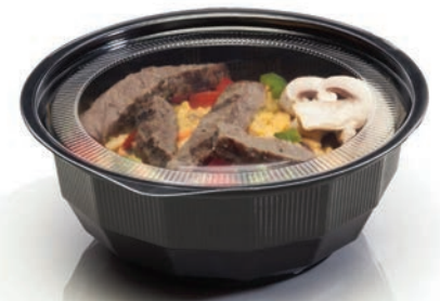
Bowl - 24025 Lid - 24200