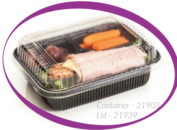
Container - 21903 Lid - 21939