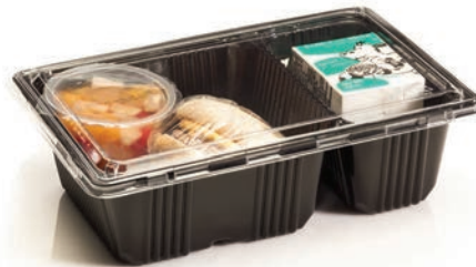
Tray - 29712 Lid - 21410