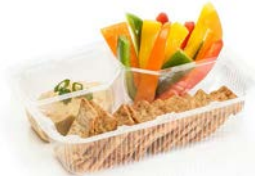
Pre-Portioned Snack Trays Page 9