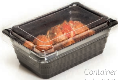
Container - 21980 Lid - 21879