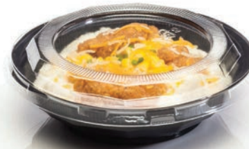
Bowl - 24009 Lid - 24400