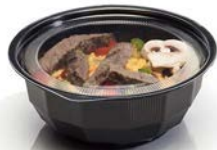
Bowls Page 15