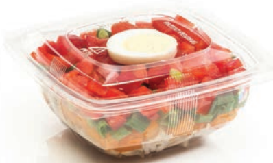
Bowl - 5BB008 Lid - 5BB200-DL