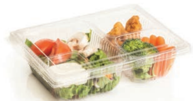
Tray - 82723 Lid - 82725