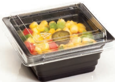
Container- 21935 Lid - 29332