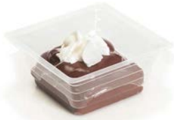
Offer Versus Serve Page 5-8