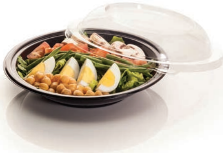
Bowl - 82638 Lid - 82639