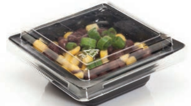
Container- 29927 Lid - 29332