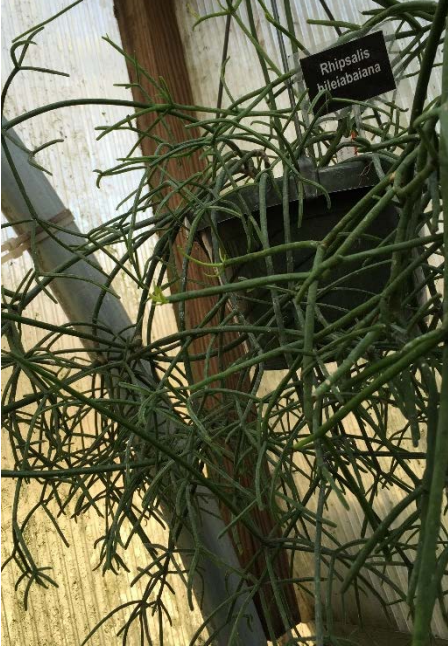
Rhipsalis hileiabaiana A,C,E