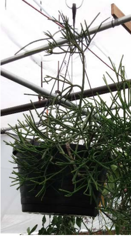
Rhipsalis cribrata A