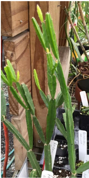
Rhipsalis cereoides B