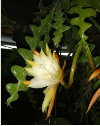
Epiphyllum anguliger B