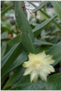
Lepismium paranganiensis A