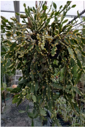
Rhipsalis oblonga B