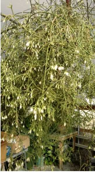
Rhipsalis cereuscula (The Rice Cactus) A,C,E