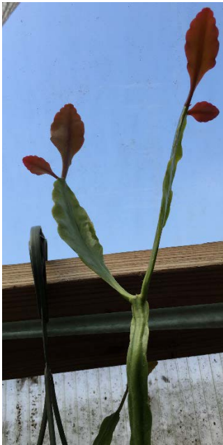
Rhipsalis crispata B