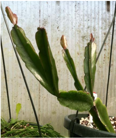
Rhipsalis agudoensis B