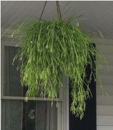
Rhipsalis campos-portoana A, F