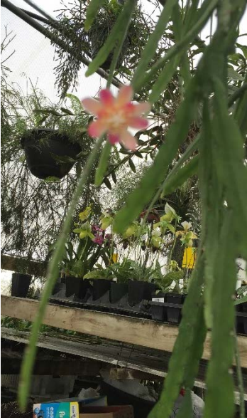
Lepismium boliviana B