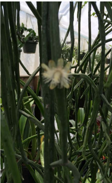
Rhipsalis aff. paradoxa B