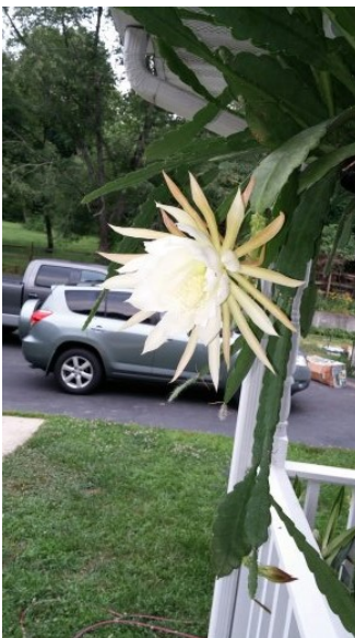
Epiphyllum crenatum (Mexico) A

Epiphyllum hookeri ssp. guatemalense monstrore B