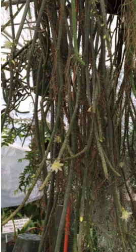
Lumbricoides (loefgrenii) B