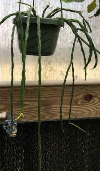
Rhipsalis paradoxa septrionalis B