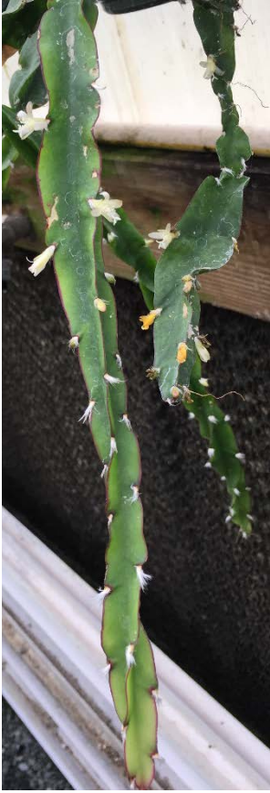
Lepismium cruciforme spiralis B