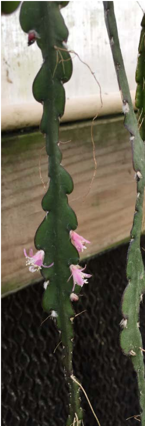
Lepismium cruciforme A