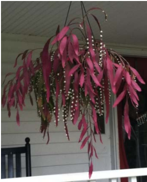
Pseudorhipsalis ramulosus 'Red'* B ($15) Or ramulosus ('Red' x self) F