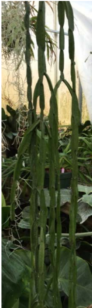
Rhipsalis paradoxa B