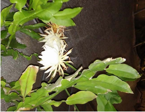
Epiphyllum oxypetalum A Epiphyllum phyllanthus rubrocoronatum (Gigante, Huila, Colombia)* B Epiphyllum pumilum A