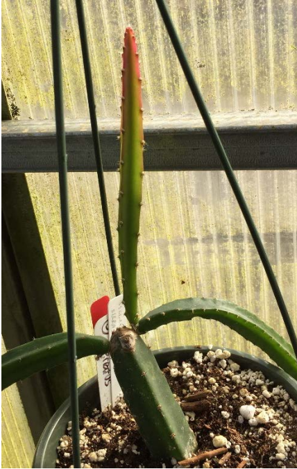
Selenicereus spinulosus A