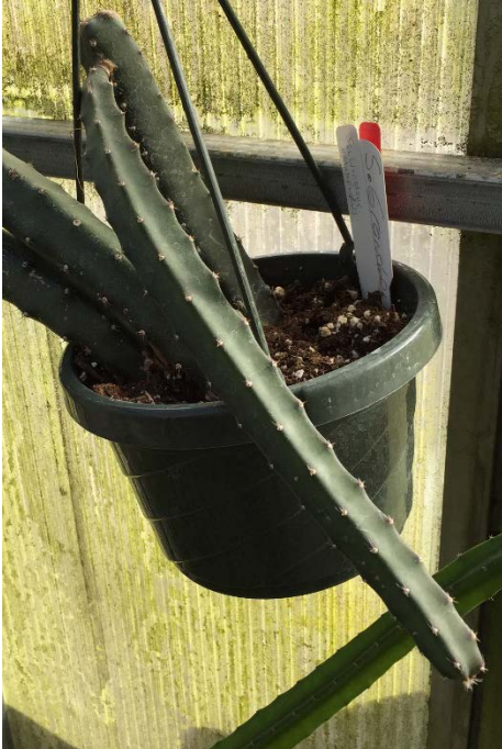
Selenicereus grandiflora B