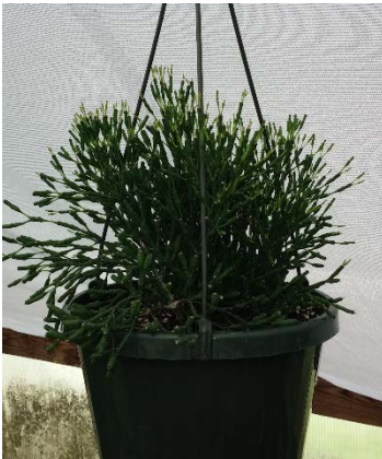
Hatiora salicornioides (Drunkard's Dream) A,C