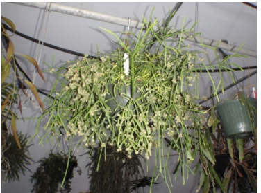
Rhipsalis baccifera (cassutha, Mistletoe Cactus)* A