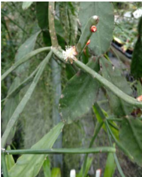
Rhipsalis marnierianum B Rhipsalis mesembryanthemoides A,C,E