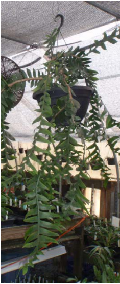
Selenicereus chrysacardius ( Marniera chrysacardium ) B,D,F