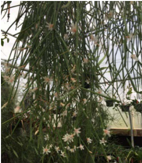
Rhipsalis puniceodiscus (darker stem, red pistils/stamens)