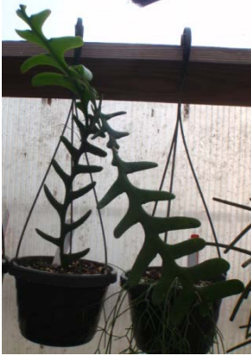
Weberocereus imitans (Eccremocactus imitans) B

Names are consistent as to source or Cactus Lexicon. Trades considered gladly.