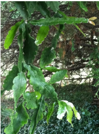
Rhipsalis elliptica B