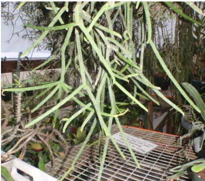
Rhipsalis shaferi B