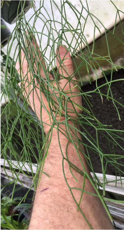
Rhipsalis simmleri B

Rhipsalis sulcata type 1 larger Rhipsalis sulcata type 2 smaller Rhipsalis teres capilliformis A