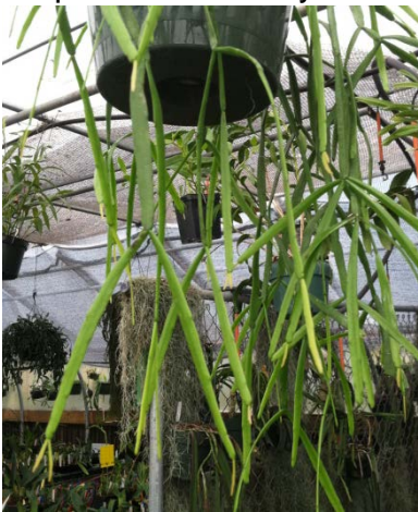
Rhipsalis micrantha B