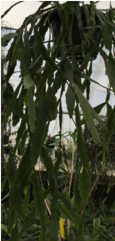
Rhipsalis occidentalis B