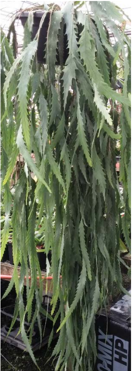
Lepismium houlettiana (forma regnellii ) B, C