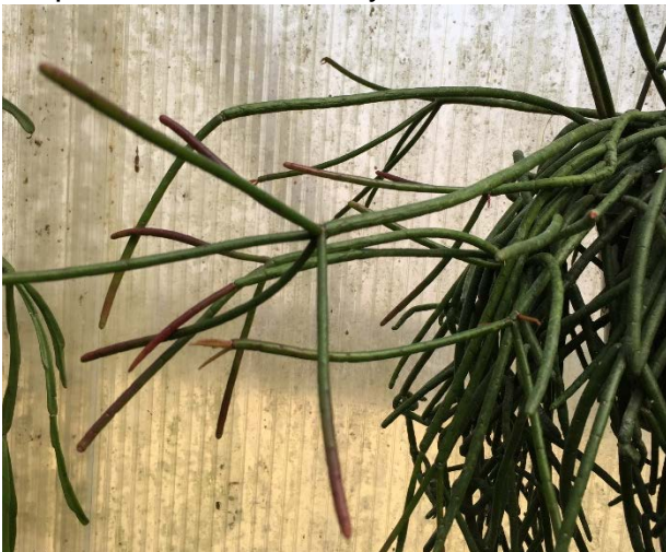
Rhipsalis baccifera mauritana B