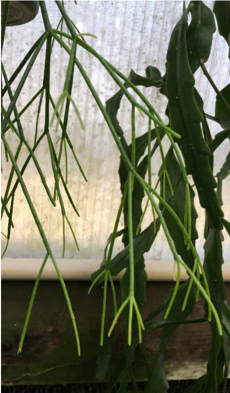
Rhipsalis heteroclada A