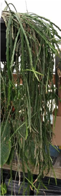
Lepismium warmingiana A,E