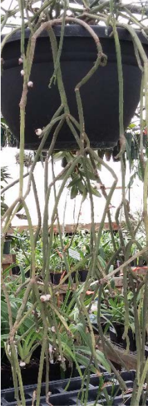
Rhipsalis floccosa tucamanensis B, F Rhipsalis grandiflora B