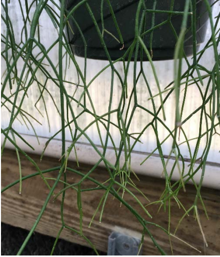
Rhipsalis burchellii B