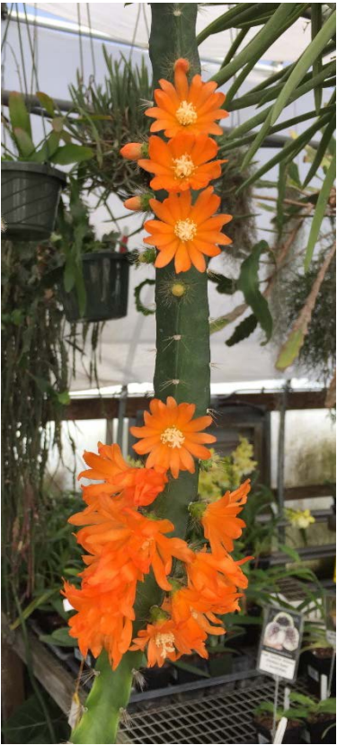
Lepismium miyagawae (Pfeiffera) $20