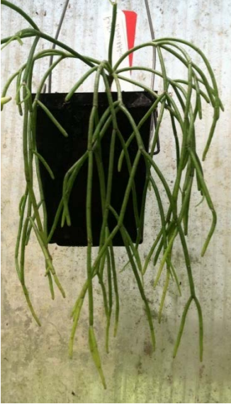
Rhipsalis zanzibarica B