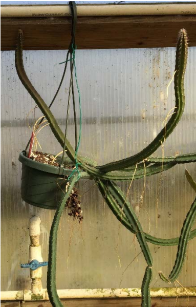
Selenicereus pteranthus B