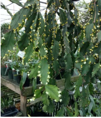
Rhipsalis pachyptera type 1 B