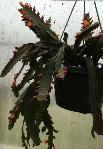
Lepismium monacantha (Pfeiffera) $20