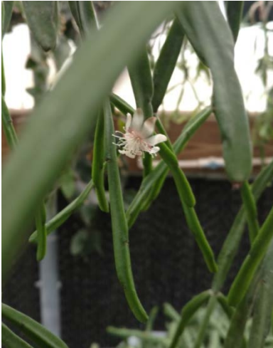
Rhipsalis trigona B

Rhipsalis sulcata type 1 larger Rhipsalis sulcata type 2 smaller Rhipsalis teres capilliformis A