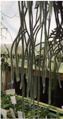
Rhipsalis baccifera horrida A,C,G ($20)