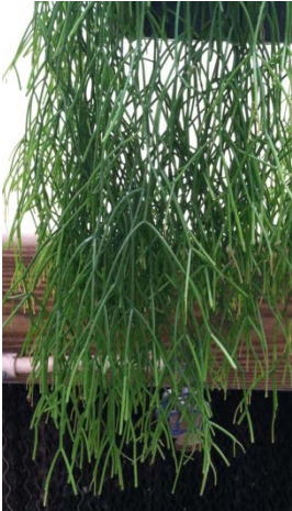
Rhipsalis clavata delicatula B