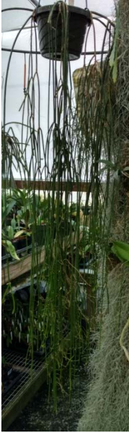
Rhipsalis baccifera Long-thin B