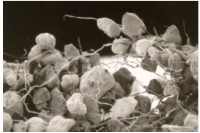
Above: Scanning electron micrograph of cyanobacterial sheath material sticking to sand grains (90 x).

Erosion control: The rough, tightly woven surface of cryptogamic crusts helps to hold soil in place in areas characterized by persistent wind and occasional torrential downpours. Additionally, the photosynthetic components often leak sticky carbohydrates which readily adhere to soil particles, holding them in place. A study conducted in Australia demonstrated that, as